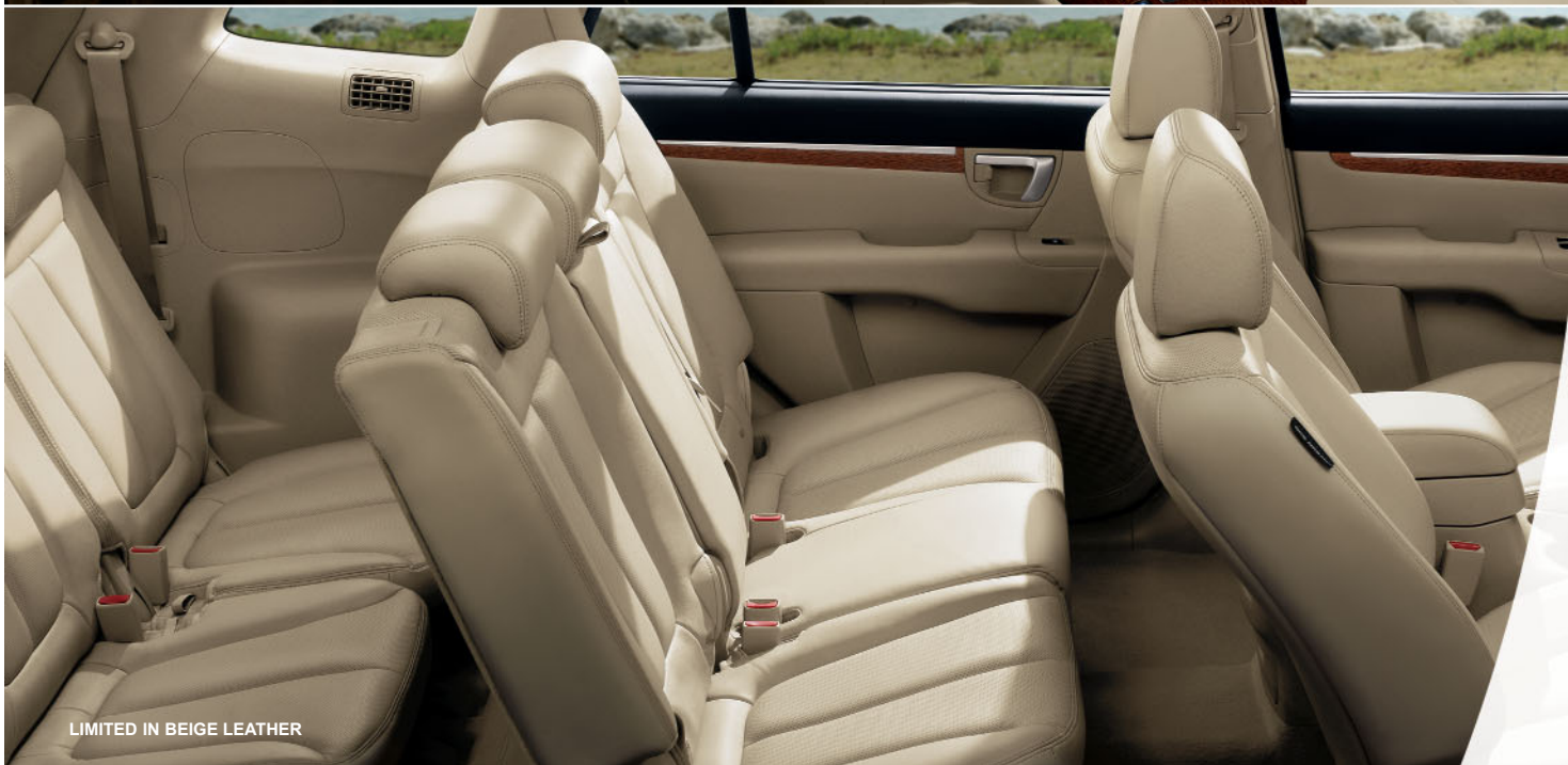
LIMITED IN BEIGE LEATHER