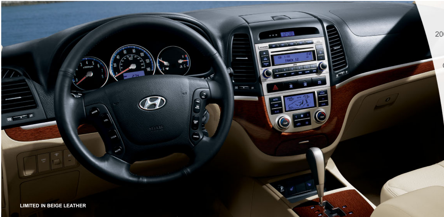
LIMITED IN BEIGE LEATHER