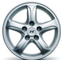
16-INCH ALLOY WHEEL