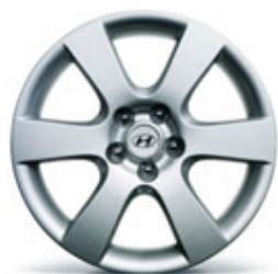
18-INCH ALLOY WHEEL