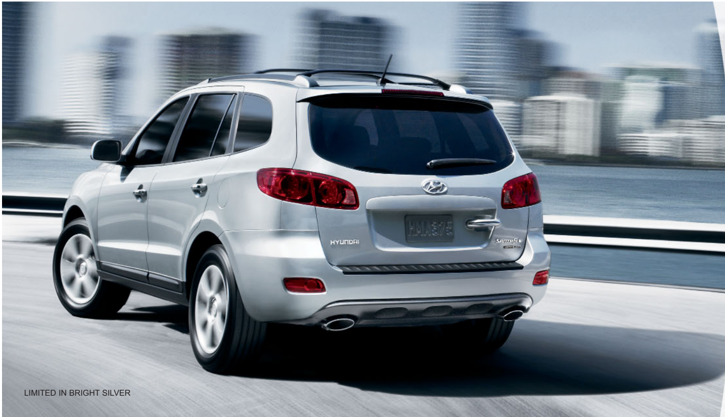
LIMITED IN BRIGHT SILVER