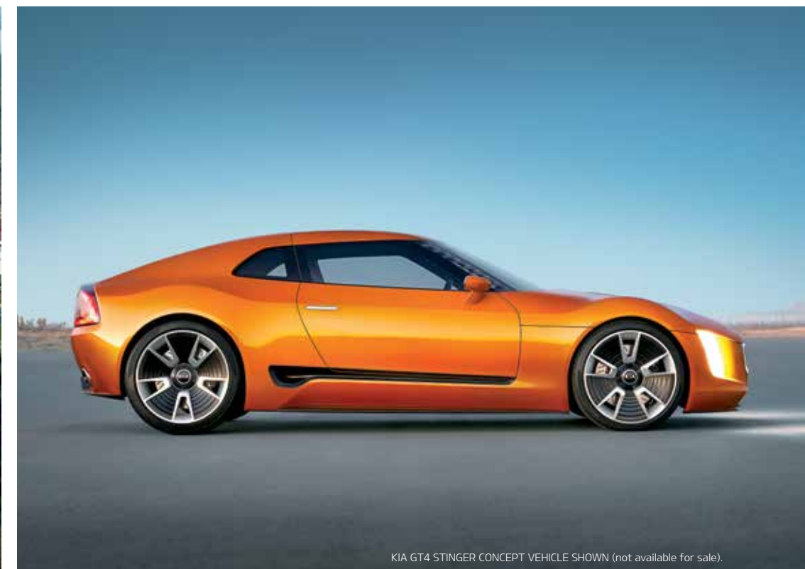
KIA GT4 STINGER CONCEPT VEHICLE SHOWN (not available for sale).