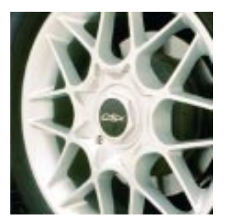
Optional 16" x 7" aluminum wheels with GSX (shown) or LSX logo center-caps are available in high luster silver or chrome finish.