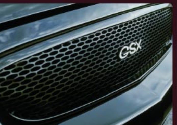
GSX's all-business stance is accentuated by a bold grille (std.) that speaks to the strong performance tradition of the Buick GS series.

Out on the road, GSX runs step-for-step with the much more expensive boys from Germany and the upstarts from Japan.