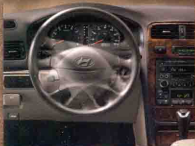
Speed-sensitive power steering automatically provides the ideal amount of power assistance for various driving situations.

If driving was simply about getting from one point to another, any car would do. Fortunately, the XG350 recognizes that a premium sedan should also make the journey thoroughly pleasurable, and is designed to satisfy discriminating drivers. If you judge a car by ride and handling, you'll be impressed by the extraordinarily smooth ride and easy handling provided by its 4-wheel independent suspension, precisely tuned chassis and Michelin® touring radial tires. Under the hood is a smooth and quiet 3.5-liter, 24-valve V6 engine designed to deliver years of responsive, dependable performance with a minimum of scheduled maintenance. Putting its power to the road is a dual-mode 5-speed automatic transmission with SHIFTRONIC™; at the touch of a lever, you can select either fully