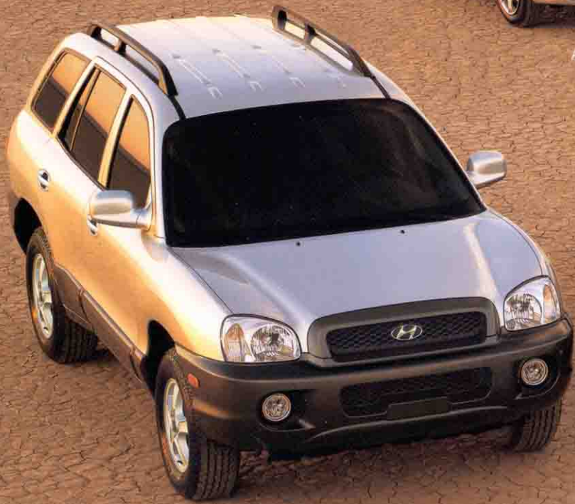
Santa Fe LX