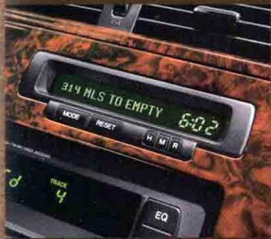
A multi-function trip computer keeps you informed of distance traveled, average speed, elapsed time and approximate miles to empty.