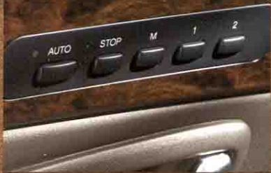
Just one touch returns the XG350's driver's seat and outside mirrors to either of its two preset positions.

lighting, it's clear that the XG350 takes a very luxurious back seat to no one.