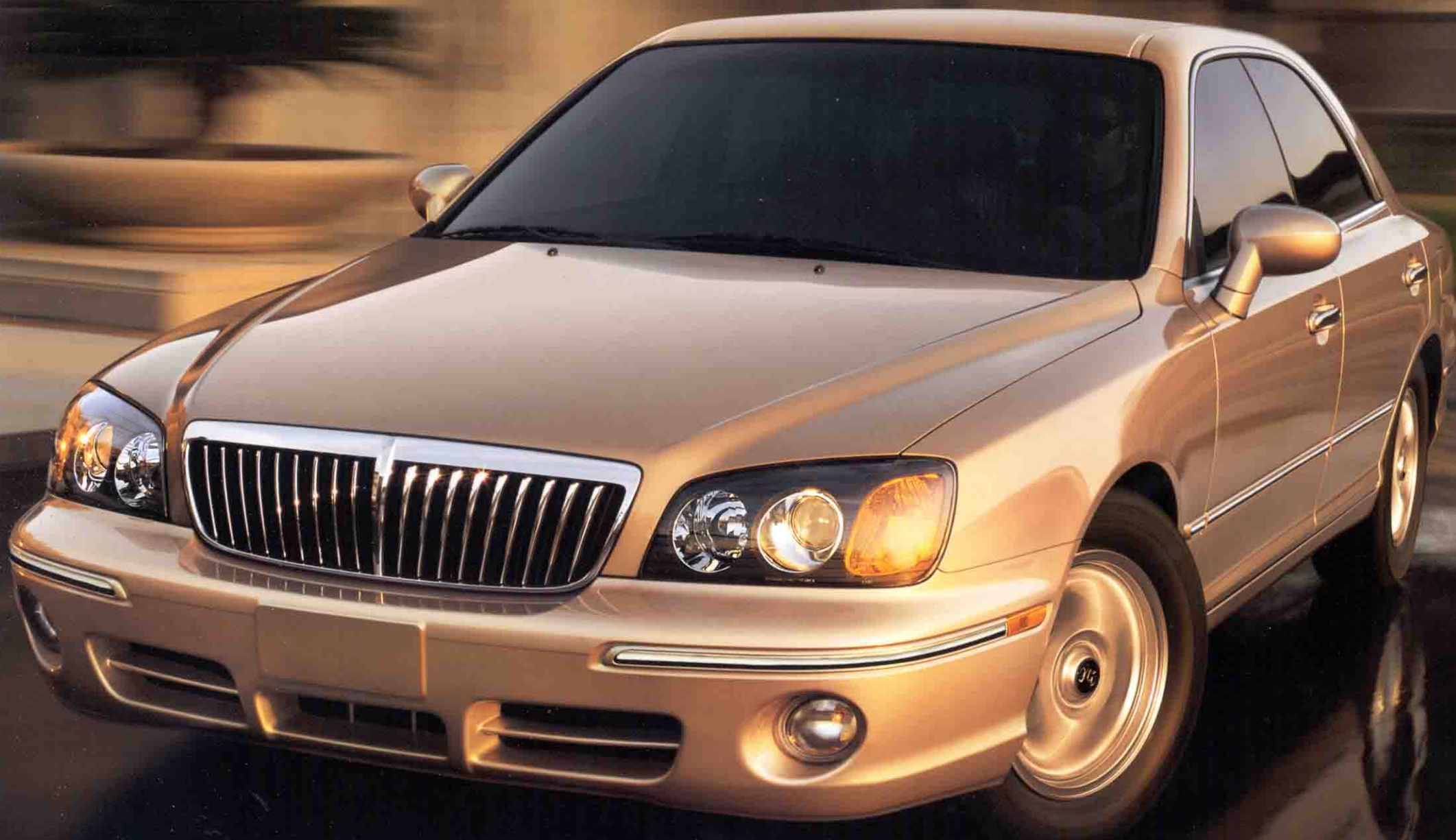
XG350 in Desert Sand