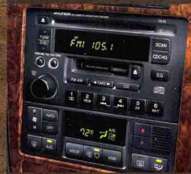
An available trunk-mounted 8-disc CD changer can be added to the standard 6-speaker AM/FM cassette/CD player.

As every good host knows, the essence of hospitality is to put your guests at ease. You'll find the same philosophy at work inside the XG350, which has been designed and equipped to make its driver and passengers feel at home from the first mile. Central to that goal is a host of luxurious standard features. The XG350 is remarkably well equipped, even when compared to cars costing thousands more. To make your driving easier and safer, there's an electronic, multi-function trip computer that keeps track of distance traveled, elapsed time, average speed and miles to empty; cruise control with steering wheel-mounted controls that keep your attention on the road; and a driver's footrest. The XG350's cabin is equally dedicated to convenience, with an assortment of storage compartments and map pockets, front and rear beverage holders, 12-volt accessory outlets and illuminated vanity mirrors. In other words, the XG350 gives you all the comforts of home – a very luxurious home.