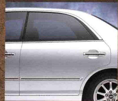
The XG350's large rear doors are designed to facilitate easy entry and exit.