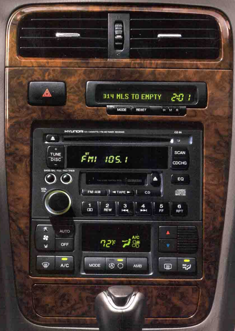
XG350 driver control center