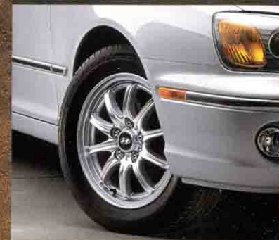
The solid stance of the XG350 is enhanced by standard 16" aluminum alloy wheels and touring-type, all-season radial tires.

heated dual power mirrors and 16-inch, 10-spoke aluminum alloy wheels.