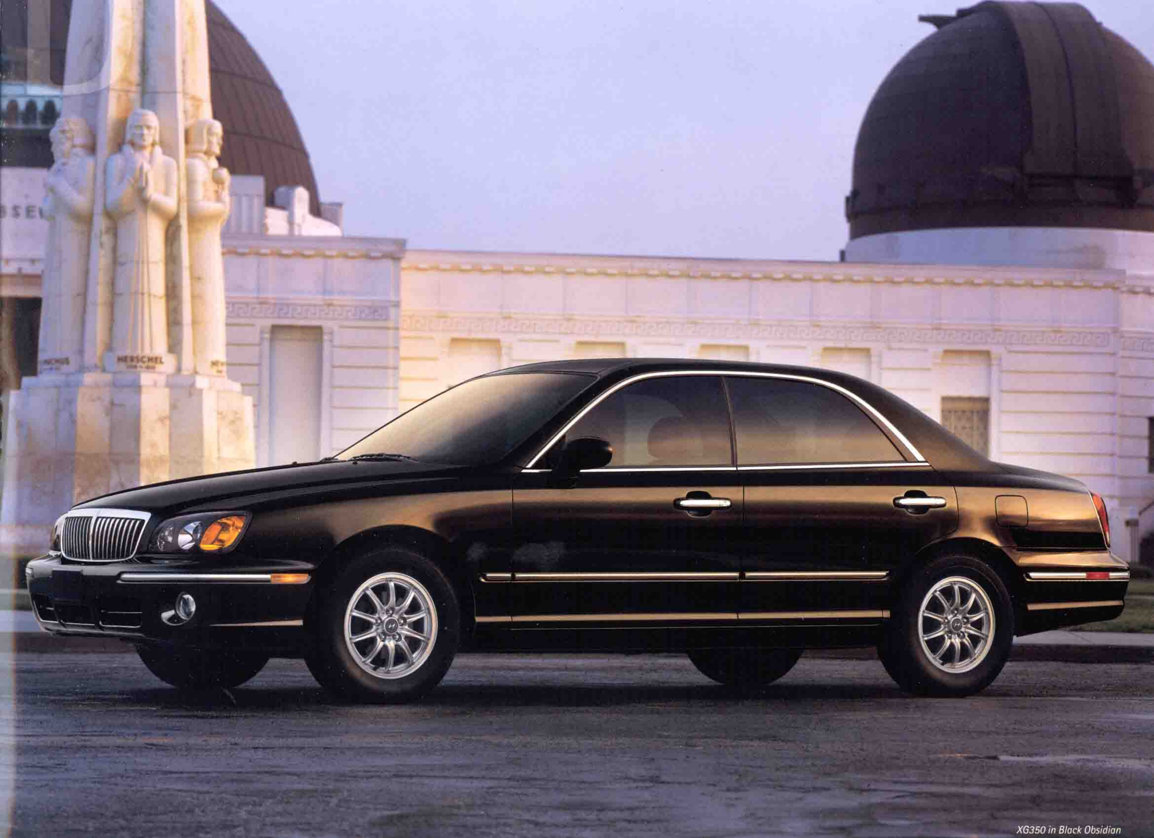
XG350 in Black Obsidian