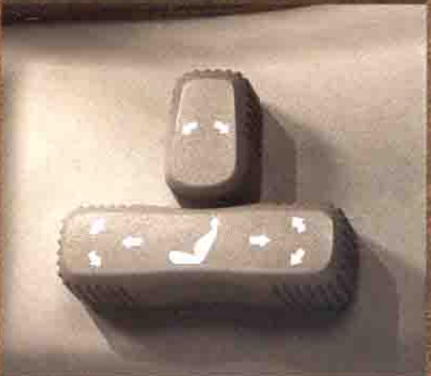
Both the driver and front passenger enjoy the comfort of dual power seats with leather seating surfaces.