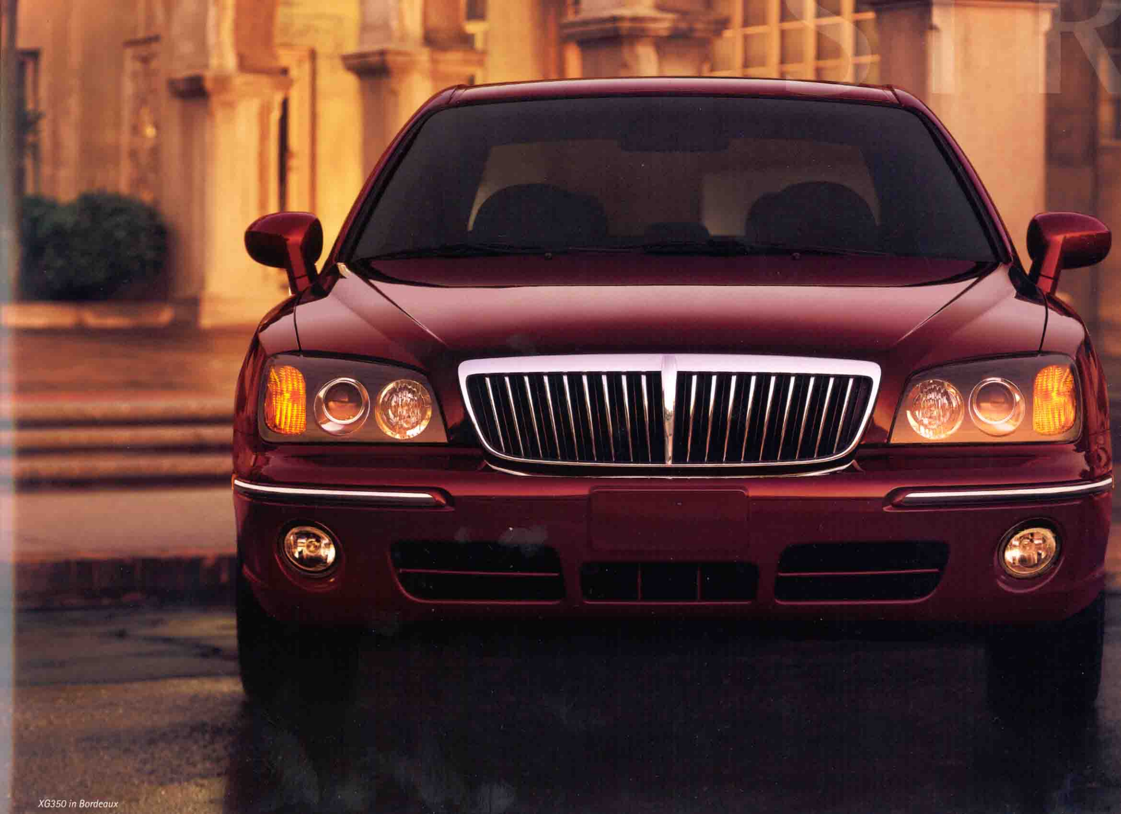
XG350 in Bordeaux