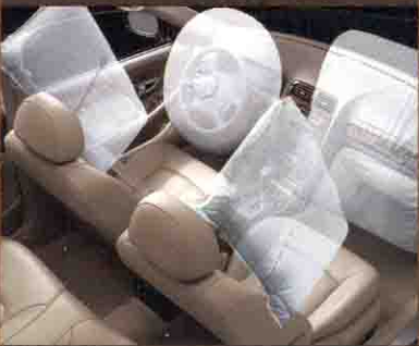
Dual front airbags and front side airbags protect the driver and front passenger in the event of an impact.