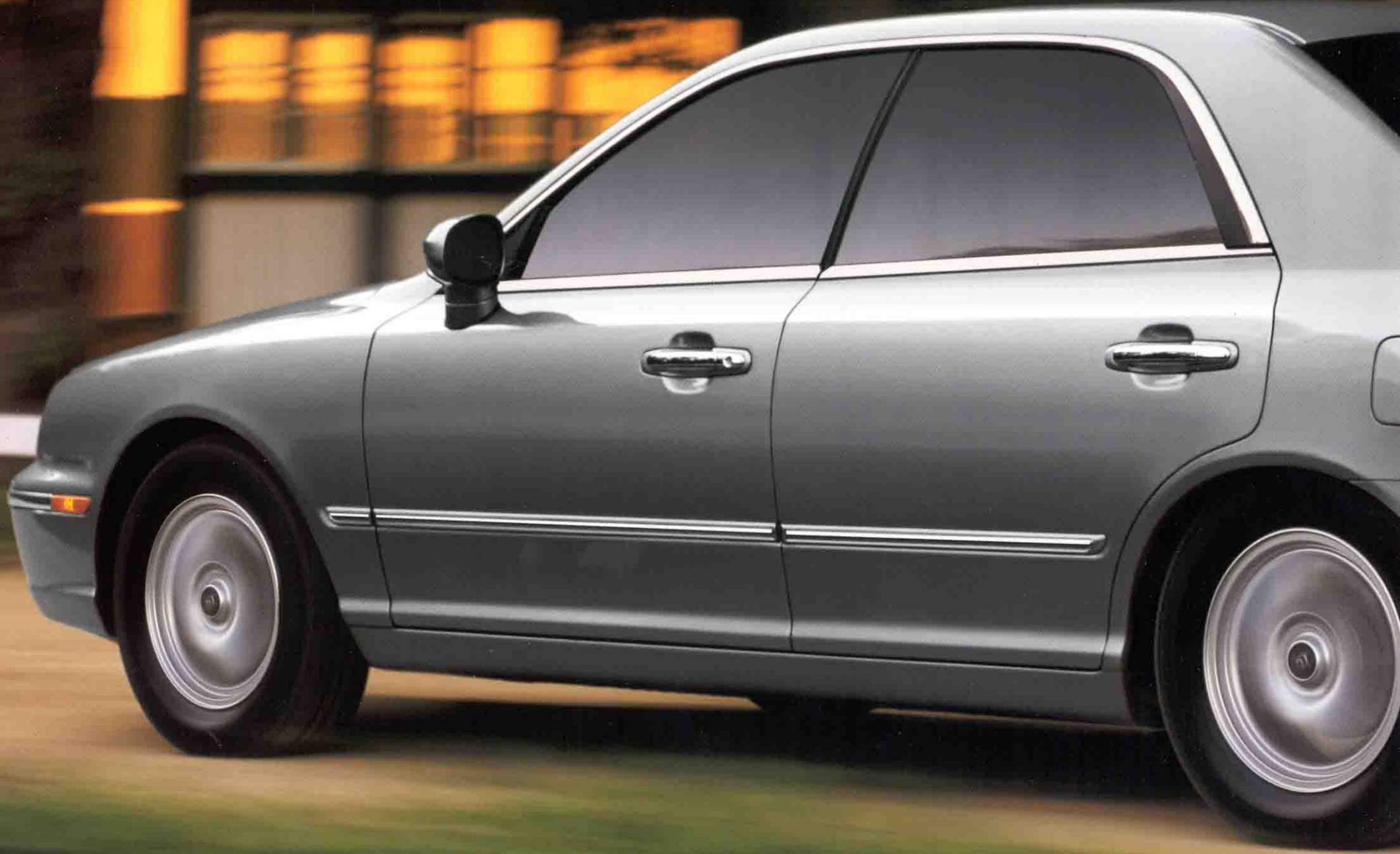
XG350 in Evening Fog