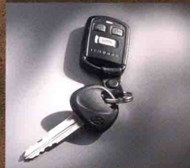
The XG350's remote keyless entry system with alarm is a welcome standard feature.