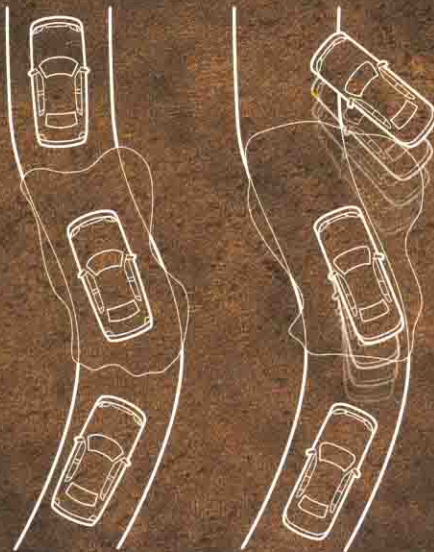
The XG350's standard Traction Control System (TCS) activates upon traction loss, applying corrective action until traction is restored.

Occupant protection, and the confidence it provides, should not be a luxury. That in mind, the XG350 comes with a host of advanced pro-