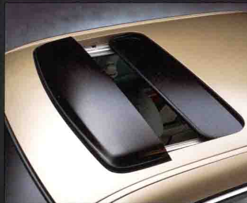
The XG350L's available wind deflector lets you enjoy quiet, draft-free motoring, even with the moonroof fully opened.