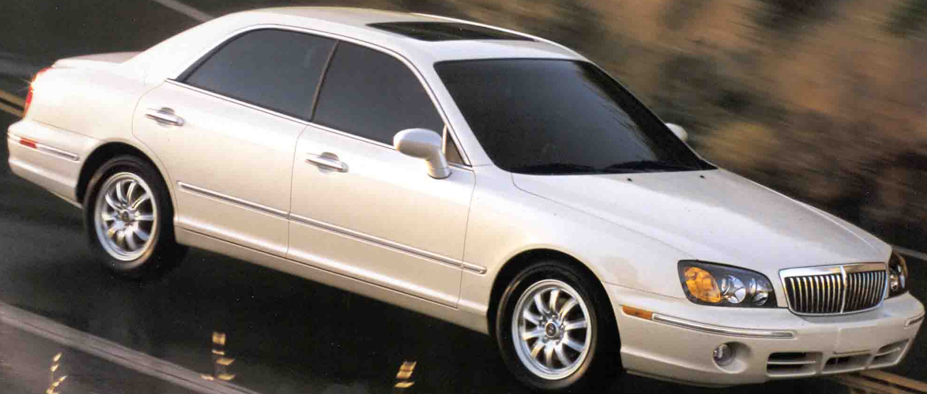
XG350L in Ivory Pearl