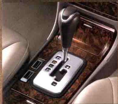
The dual-mode 5-speed automatic transmission with SHIFTRONIC™ offers a choice of fully automatic or manual sport shifting.