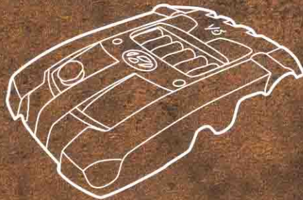
The 3.5-liter aluminum alloy V6 engine produces an impressive 194 horsepower.

If driving was simply about getting from one point to another, any car would do. Fortunately, the XG350 recognizes that a premium sedan should also make the journey thoroughly pleasurable, and is designed to satisfy discriminating drivers. If you judge a car by ride and handling, you'll be impressed by the extraordinarily smooth ride and easy handling provided by its 4-wheel independent suspension, precisely tuned chassis and Michelin® touring radial tires. Under the hood is a smooth and quiet 3.5-liter, 24-valve V6 engine designed to deliver years of responsive, dependable performance with a minimum of scheduled maintenance. Putting its power to the road is a dual-mode 5-speed automatic transmission with SHIFTRONIC™; at the touch of a lever, you can select either fully