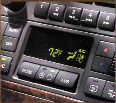
The standard automatic climate control system is designed to accurately maintain a preset interior temperature.