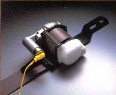
The 3-point front seatbelt pretensioners lock in the event of a moderate to severe frontal impact.