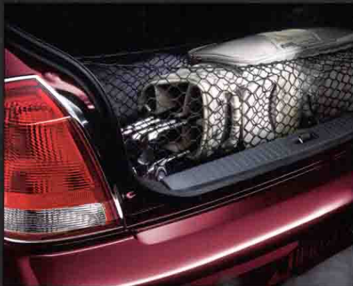
From golf clubs to groceries, a custom-fitting trunk cargo net keeps important items in place.

Your Hyundai dealer can show you a full line of genuine Hyundai accessories designed to make driving your XG350 even more enjoyable. To keep your Hyundai looking and running like new, always use genuine Hyundai parts and accessories, which meet our own strict standards for quality and durability.