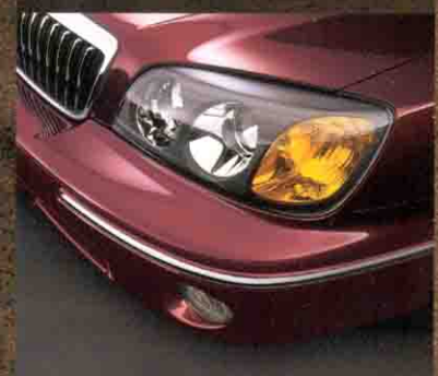
For safer night driving, clear lens, projector-type headlights illuminate the road with bright halogen beams.