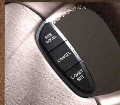
Steering wheel-mounted cruise control switches keep your attention on the road.