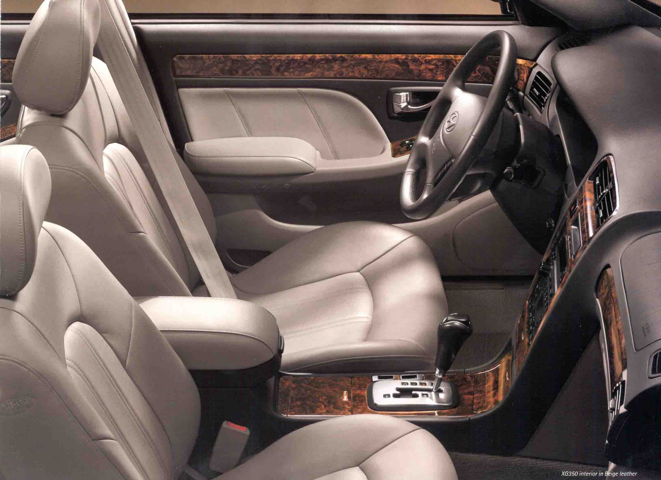
XG350 interior in Beige leather