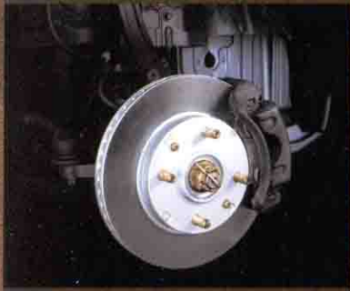
Standard 4-wheel power disc brakes include an Anti-lock Braking System (ABS) that monitors each wheel independently for maximum effectiveness.