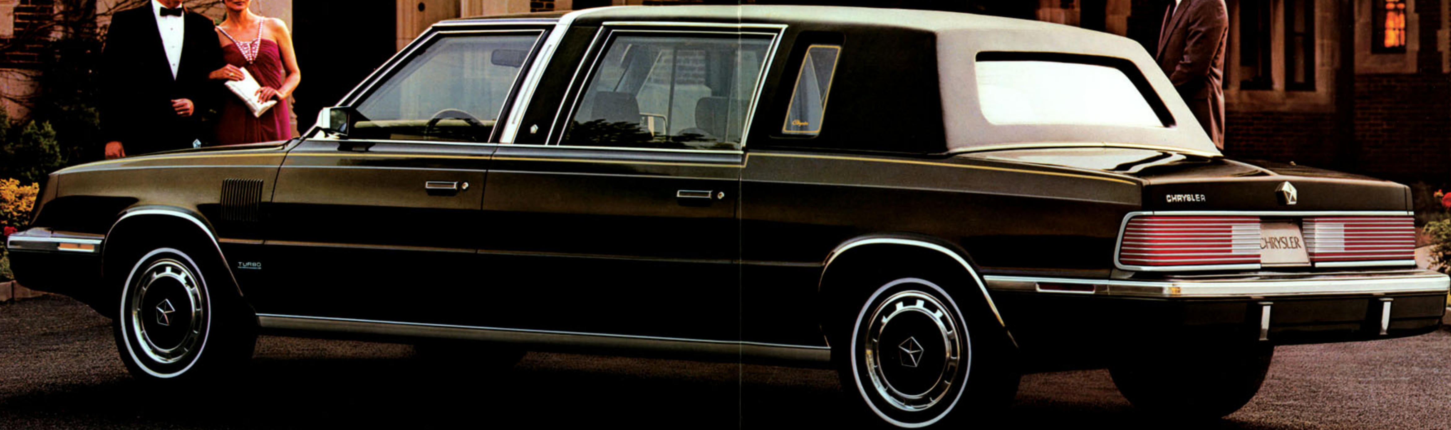
Chrysler Limousine, shown in Black.