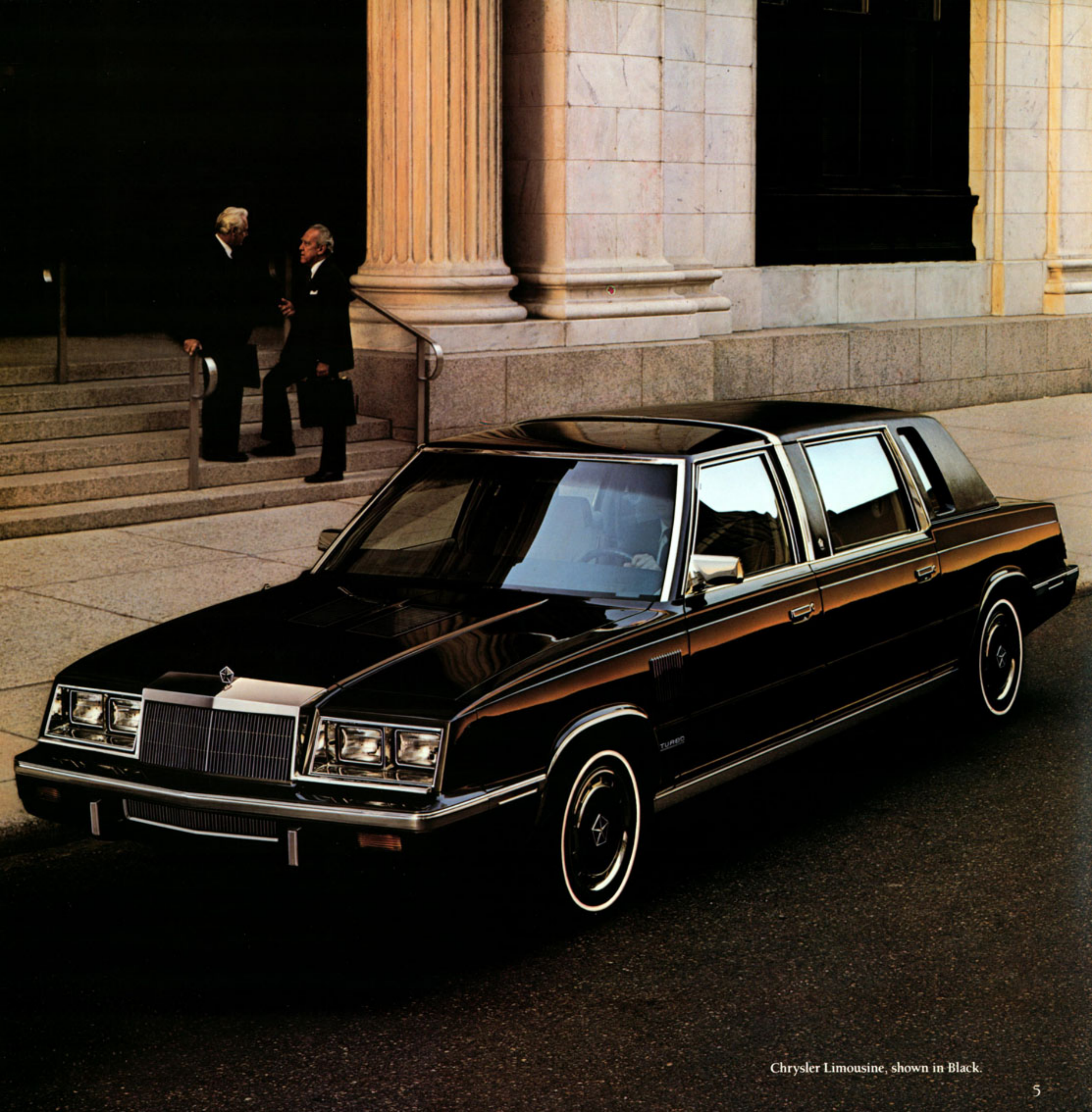
Chrysler Limousine, shown in Black.