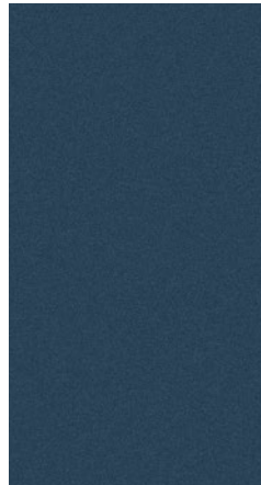
Graphite Blue RAQ