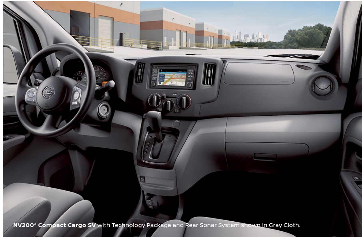
NV200® Compact Cargo SV with Technology Package and Rear Sonar System shown in Gray Cloth.