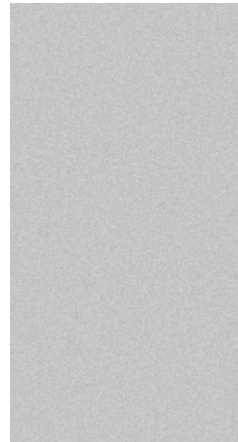
Brilliant Silver K23