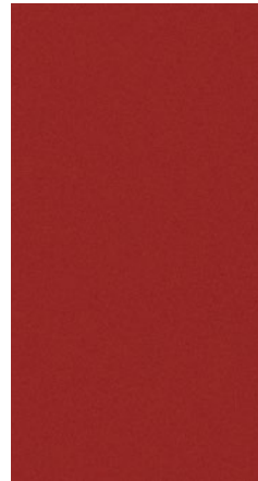
Cayenne Red NAH