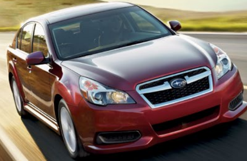
Legacy 2.5i Premium in Venetian Red Pearl. Production model may vary.

A 2013 IIHS Top Safety Pick Plus and Top Safety Pick for eight years running (2006–2013).* —Insurance Institute for Highway Safety (IIHS)