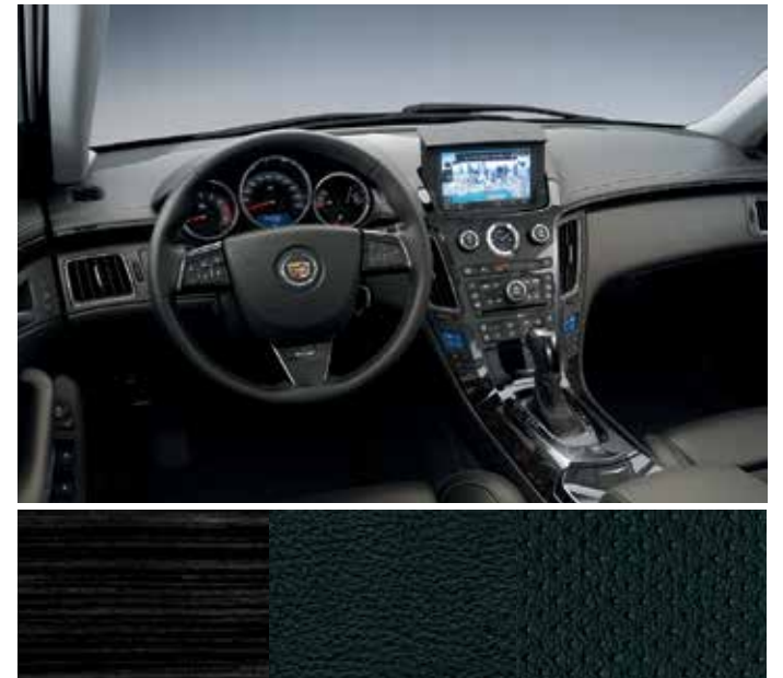
Light Titanium RECARO® performance seats with Light Titanium sueded microfiber inserts / Midnight Sapele Wood Trim²