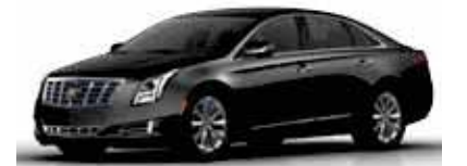
BLACK DIAMOND TRICOAT 1,3