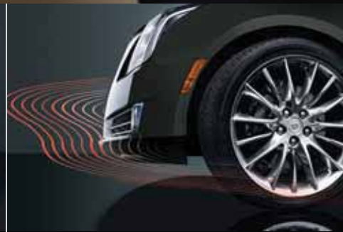
AVAILABLE AUTOMATIC FRONT BRAKING 1