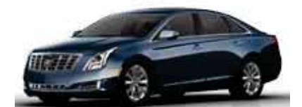
SAPPHIRE BLUE METALLIC 3