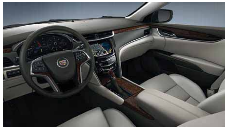
XTS PLATINUM COLLECTION / Light Platinum with Dark Urban and Cocoa accents 5