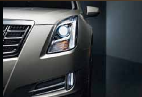
AVAILABLE LED SIGNATURE LIGHTING

XTS PREMIUM COLLECTION / Caramel with Jet Black accents