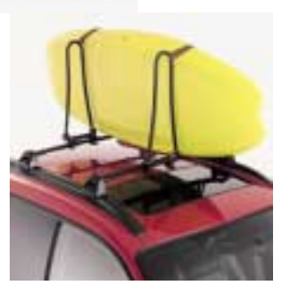
Kayak carrier. Attaches quickly and easily to cross bars. Carries two kayaks.