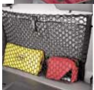
Cargo net, vertical. For secure storage of items behind the rear seat.