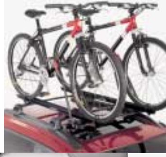
Bike attachment. Transports two bicycles in secure fashion.