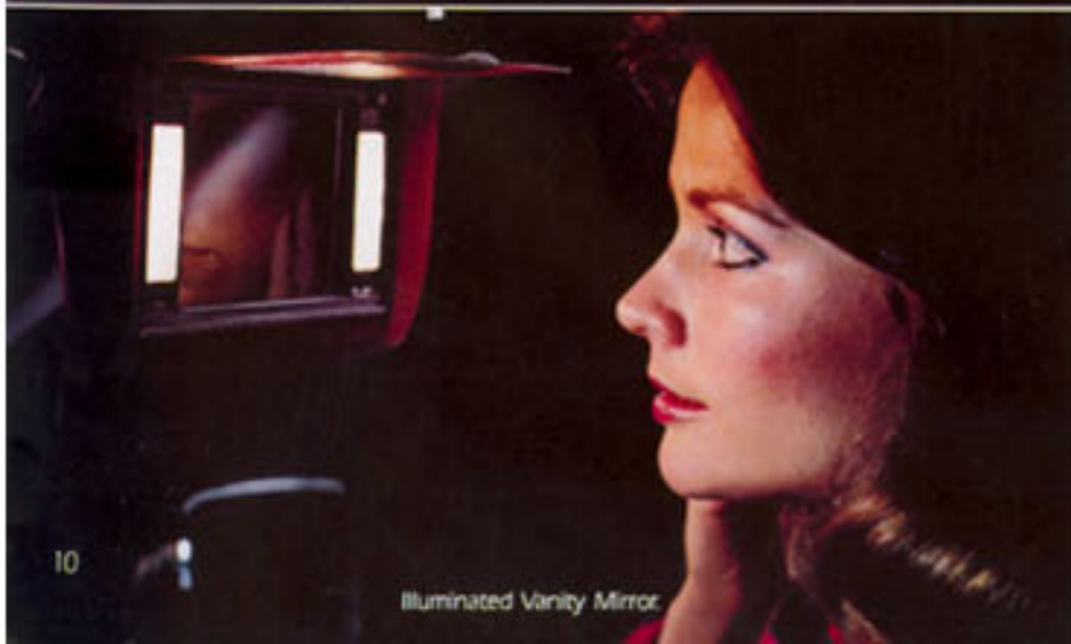
Illuminated Vanity Mirror.