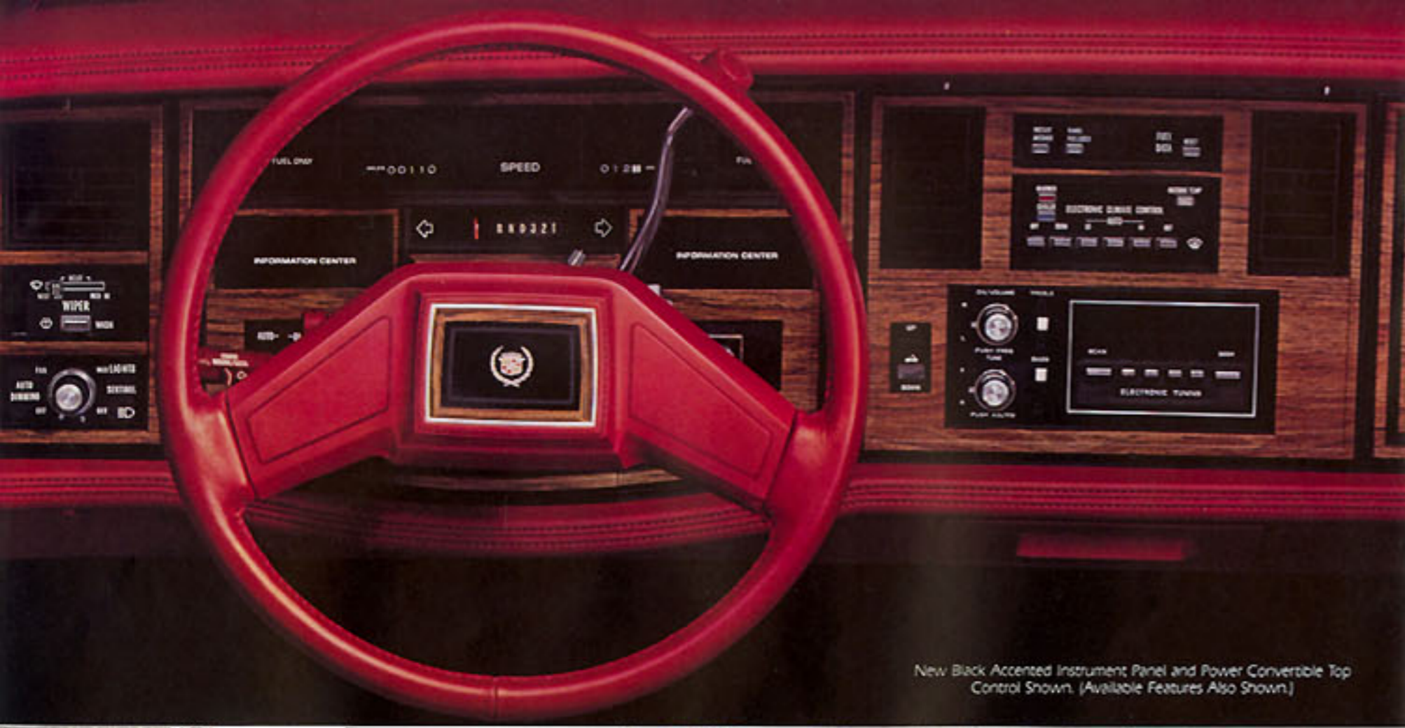
New Black Accented Instrument Panel and Power Convertible Top Control Shown. (Available Features Also Shown.)