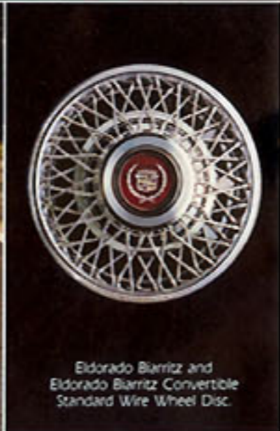
Eldorado Biarritz and Eldorado Biarritz Convertible Standard Wire Wheel Disc.