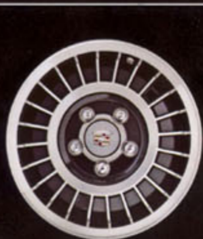
Aluminum Alloy Wheel.