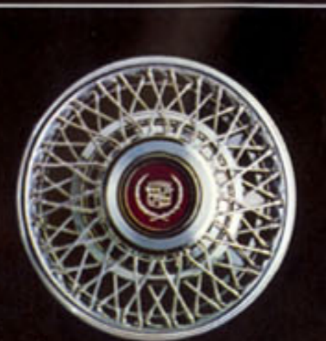
Wire Wheel Disc.