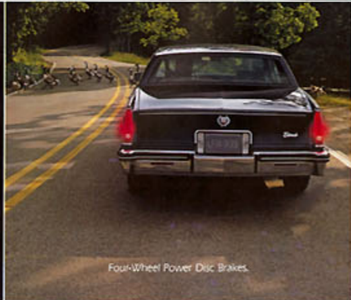
Four-Wheel Power Disc Brakes.