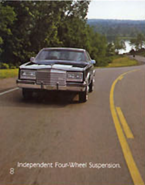
Independent Four-Wheel Suspension.

*CAUTION: For Use with Tire Chairs, See Owner's Manual.