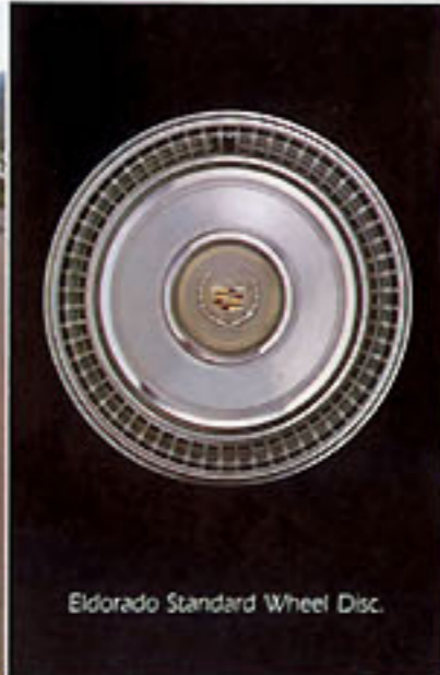
Eldorado Standard Wheel Disc.