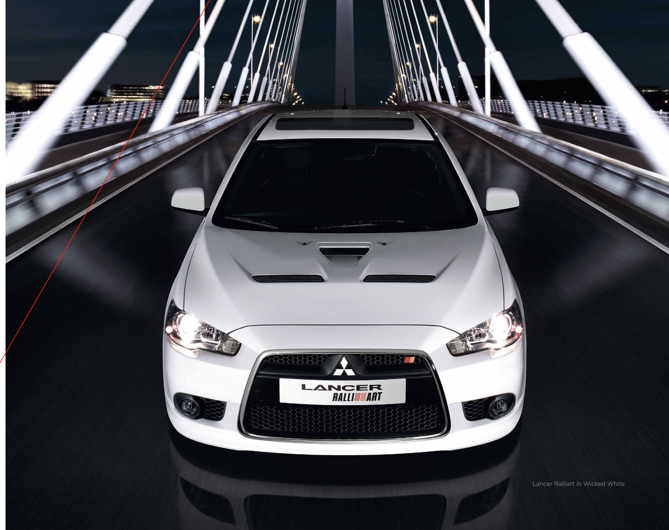
Lancer Ralliart in Wicked White

Taking action on traction. Combining an electronically-controlled 4WD system with our Active Stability and Traction Control system, All-Wheel Control regulates drive torque from front-to-rear with a network of dynamic handling technologies. The result: Enhanced driving performance and traction under a variety of road conditions.