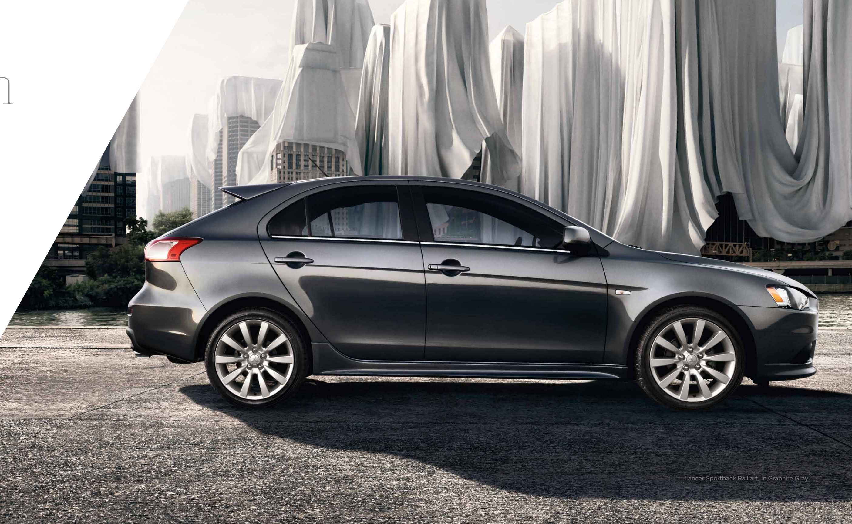
Lancer Sportback Ralliart in Graphite Gray