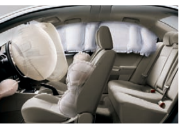
Seven Standard Airbags