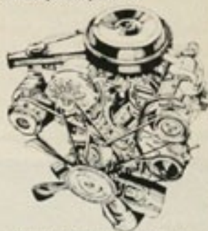
3.8 liter (231 CID) 2-bbl. V-6

saves weight over a V-8 and they occupy less space. They're appropriate for today's body styles. This size and weight saving promotes economical operation, which is more important today than ever.