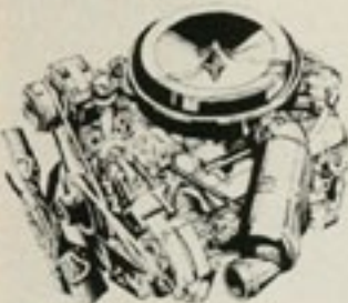
5.7 liter (350 CID) diesel V-8

Some good reason why diesels are popular.