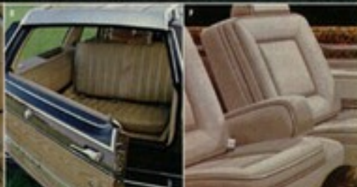
▲ Electra Estate Wagon. ■ Electra Estate Wagon instrument panel with available equipment. ● Available diesel V-8 engine. ● Lockable storage compartment. ■ Two-way tailgate with available third seat. ♣ Electra Estate Wagon 55/45 notchback seat.