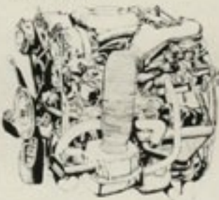
3.8 liter (231 CID) 4-bbl. turbocharged V-6

Buick Division is known as "The Home of the Turbocharged V-6," because this engine first appeared in selected 1978 Buicks. It continues to be the standard offering in the Riviera T TYPE and Regal Sport Coupe, and available in the Riviera. It is not available in California in either Riviera.