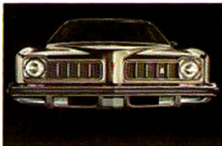
Luxury LeMans' distinctive die-cast grille.