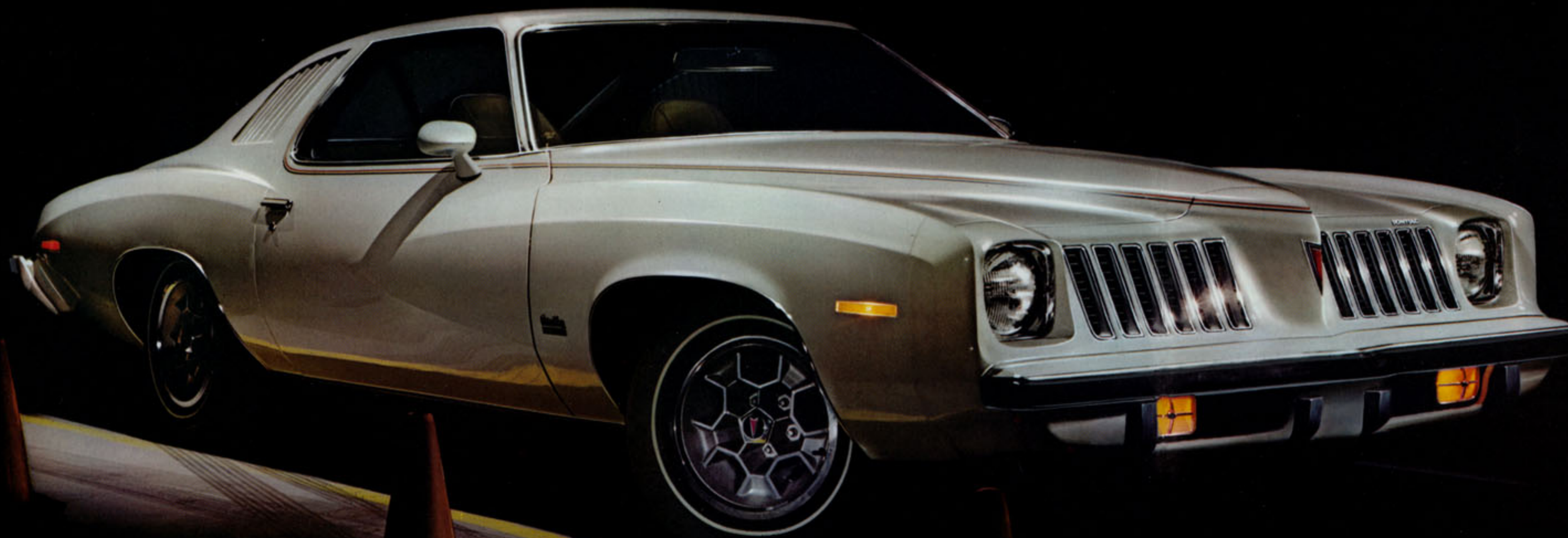
Grand Am 2-Door Colonnade Hardtop in Cameo White.

Grand Am's standard all-Morrokode upholstery. Shown in burgundy—also available in white, saddle, green and beige.