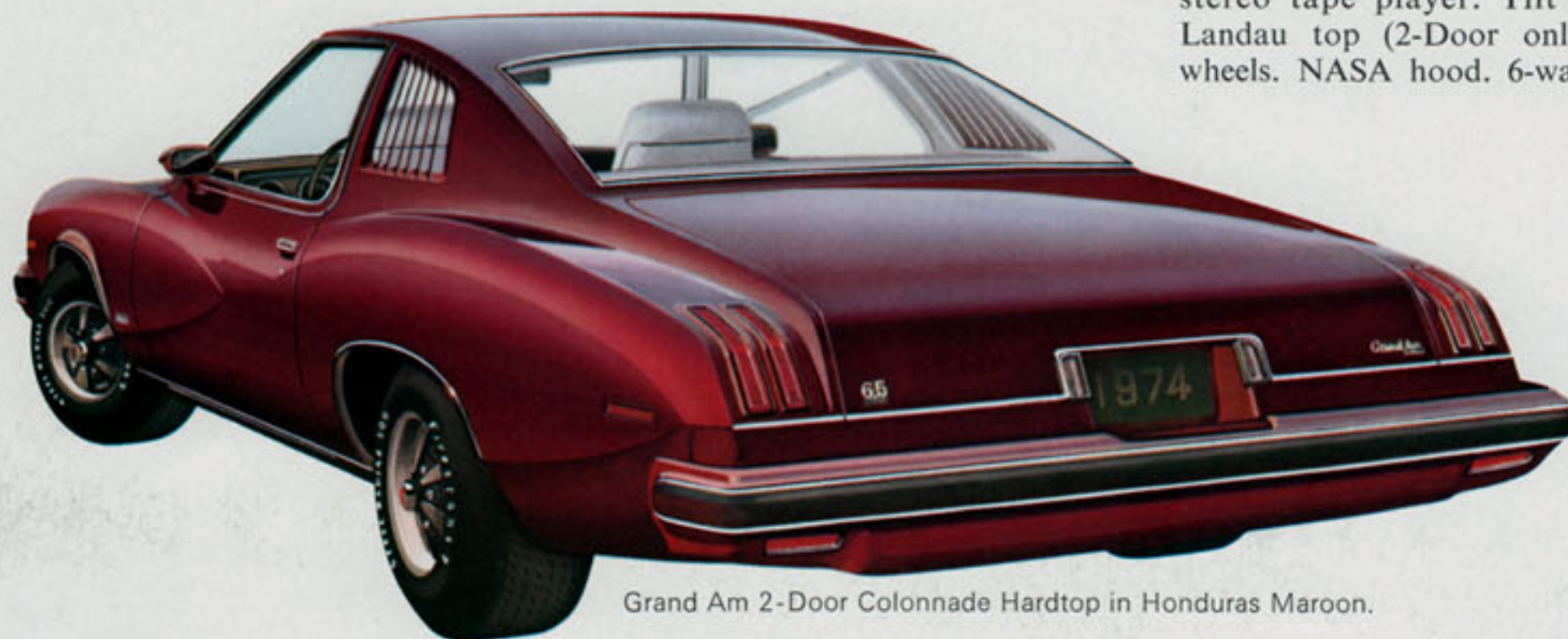
Grand Am 2-Door Colonnade Hardtop in Honduras Maroon.