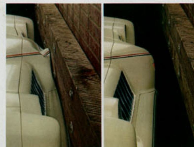
Grand Am's amazing nose. It gives . . . then springs back to shape.

Color-keyed striping. Power windows with convenient power window pods on doors. Complete lineup of audio equipment including stereo radio with an integral 8-track stereo tape player. Tilt steering wheel. Landau top (2-Door only). Honeycomb wheels. NASA hood. 6-way power seat.