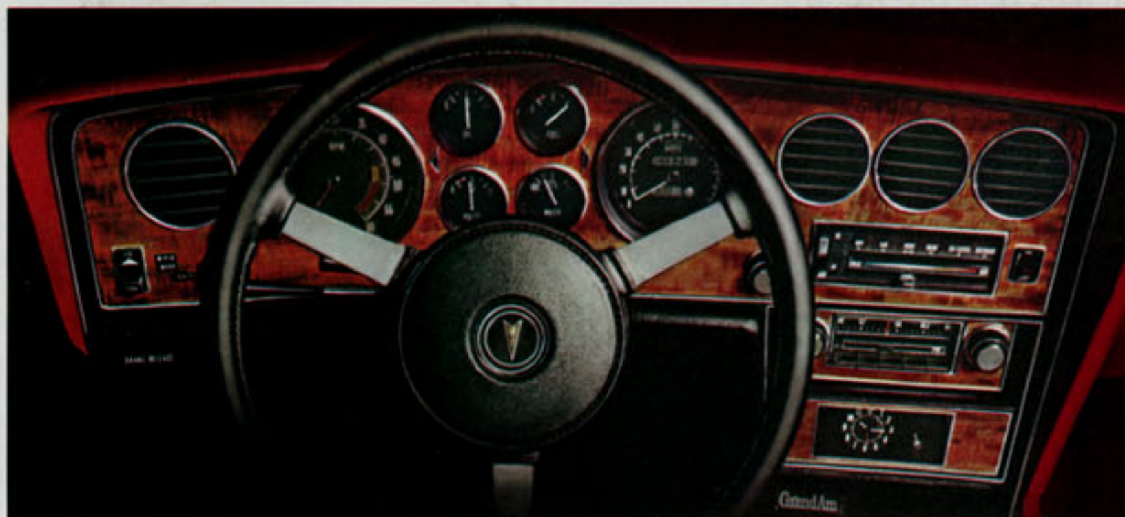
Grand Am instrument panel with standard rally gauge cluster and available tachometer.