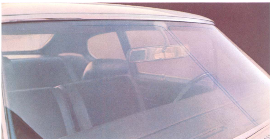
Windshield Antenna. A Grand Prix first and now standard equipment on all Pontiacs. Three big advantages. First, the radio reception is excellent. Second, it does away with the headache (and expense) of bent and broken antennas. Third, it eliminates the old-fashioned "buggy whip"—adds to Pontiac's smoother, cleaner look.