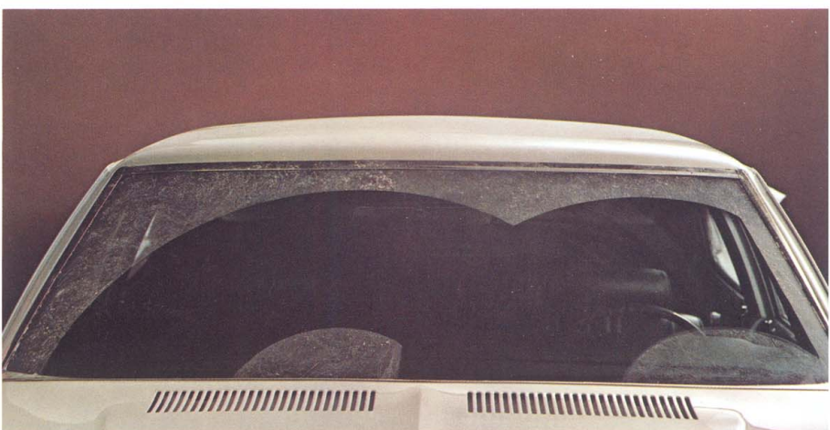
Concealed Windshield Wipers. Another Pontiac innovation. These wipers stay completely out of sight when not in use, giving a much neater appearance. And the left blade is articulated —which means it wipes clean into left corners and edges of windshield to help give the driver a wide view of the road. (Available on Tempest.)