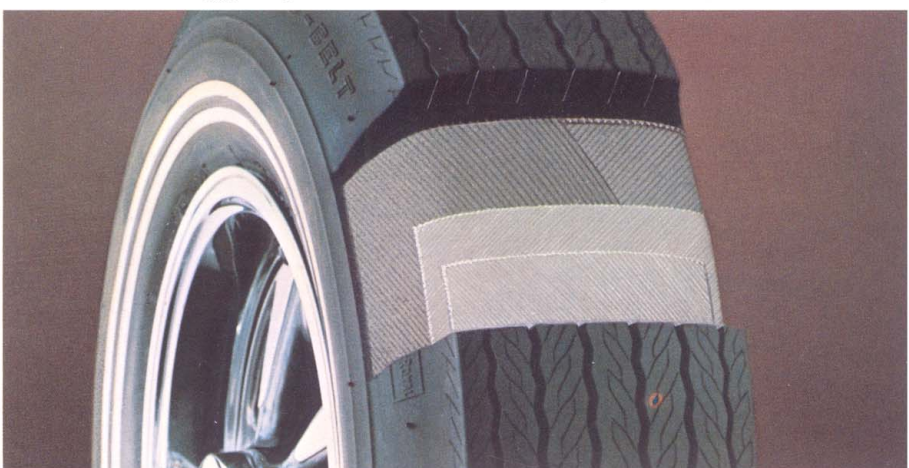
Bias-belted Tires. These do some really nice things for Pontiac owners. Like giving substantially longer tire life . . . improving traction . . . and offering greater resistance to damage from chuckholes and other road hazards. Reassuring to have on your Pontiac.