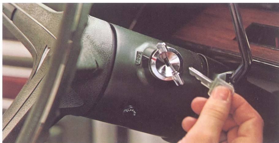
Steering Column Lock. The instant you remove the ignition key, your '70 Pontiac's steering column is securely locked. It's the kind of security and protection that pleases Pontiac owners. (But it's been a great blow to car thieves.)