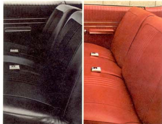
Strato-bucket seats, air conditioning and stereo are extra-cost options. They're available at extra cost and with weight of 1