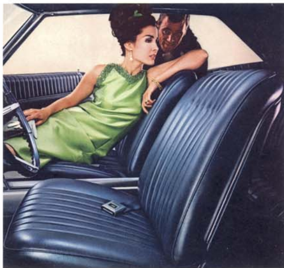
(Shown on this page are some items from the many options and custom features offered by Pontiac on the back cover. They're available at extra cost and will vary.)

Grand Prix has been setting the standard for personal luxury cars ever since it was introduced—and this year is no exception. A few good reasons why, you can see on these pages. Its monochromatic interior of expanded Morrokide comes in a choice of no less than seven beautiful colors. It's standard, of course. As are things like bucket seats, full nylon blend carpeting, Carpathian elm burl styling on dash and console, plus a whole slew of convenience features you'd expect to pay extra for. (You don't have to pay extra for the Strato-bench front seat with free-standing arm-rest on the hardtop coupe, but you have to give up the console. Decisions, decisions.) Your choice of power ranges all the way up to a 376-hp 428 cubic inch V-8, and options include everything from headrests to power seats and window lifts.