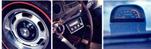
The Rally I wheel. An extra-cost option.