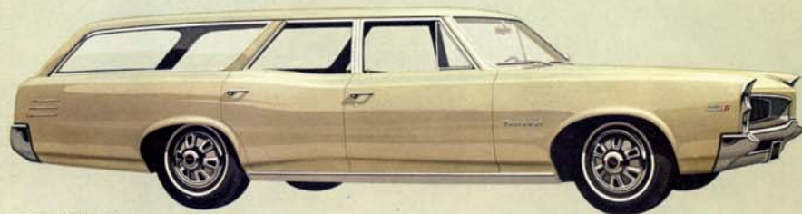
TEMPEST STATION WAGON

That elegant wagon with walnut wood grain styled paneling you see at the top of the page is our Tempest Safari, of which we are exceedingly proud. Where else can you get looks like this, an all Morrokide interior, nylon blend carpeting in the passenger area, and a revolutionary 165-hp Overhead Cam Six engine as standard equipment? Even the instrument panel has wood grained styling—and at these low prices! But if economy is more of a consideration, you'll want to look at our Tempest Custom. Same 165-hp OHC 6. Same superb Pontiac styling. Carpeting. All Morrokide interior. And, of course, there's our Tempest—the last word in quality with a price tag that has the honor of being the lowest in our Wide-Track wagon lineup. Really though, if you're a wagon fan, get a copy of our special wagon catalog and spend a few hours perusing it. It's a revelation.