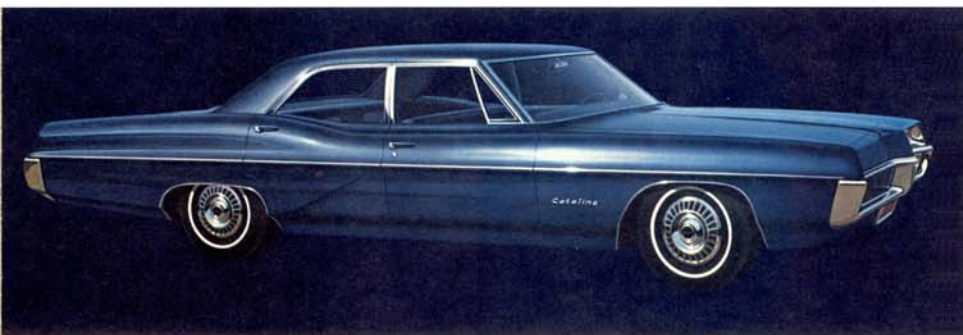
CATALINA 4-DOOR SEDAN

Catalina offers so much for so little that we bring it to you in no less than seven exciting models. You have your choice of two- and four-door sedans, a hardtop coupe, a four-door hardtop, 2- and 3-seat station wagons, and a convertible. The Catalina wagons are discussed at length a few pages down. Your dealer will be happy to discuss them all in copious detail.