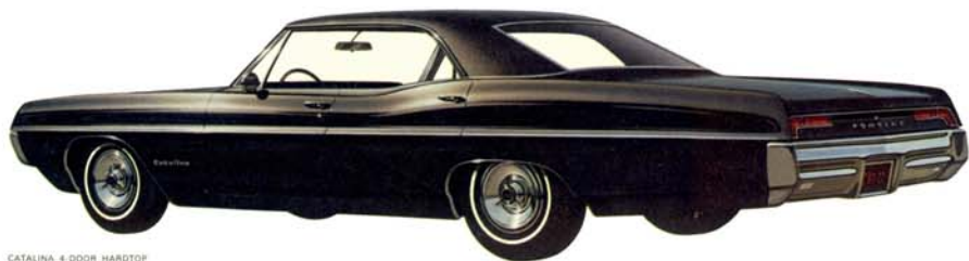
CATALINA 4-DOOR HARDTOP