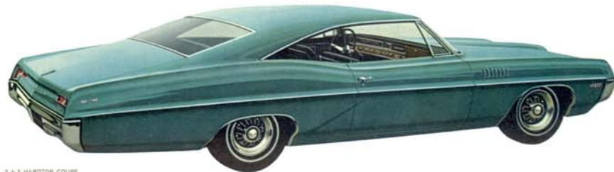
3+2 HARDTOP COUPE