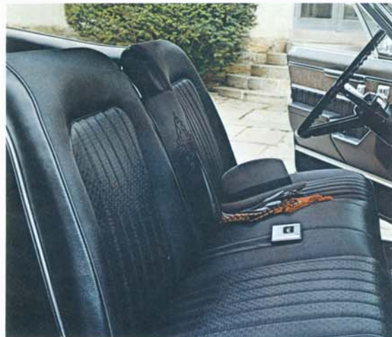
Shown on the cars in this catalog are just items from the many options and custom features offered by Pontiac on the Brougham. There's a wealth of extra cost and well worth it.

What can we tell you about Brougham after you've seen the previous pages? You already know it's the most elegantly styled Pontiac we've ever made. Yet its aristocratic lines barely hint at the unshamed luxury of its interiors. Feast your eyes on the sample below (those tasteful touches of expanded Morrokide are blended with sumptuous Plaza bolster cloth and Princessa pattern cloth), then consider such things as thick nylon blend carpeting, power windows (with controls in driver's armrest), new flexible door pulls, extra-thick foam seat padding, new Carpathian elm burl grain styling on door panels and dash, an electric clock, and a deluxe steering wheel. They're all standard. As is the Strato-bench front seat with free-standing center armrest. Luxurious? Luxurious. But that's hardly all. Brougham's standard 333-hp V-8 (325-hp with Turbo Hydra-Matic) will have to be experienced in the quick to be fully appreciated. And, of course, there's the supreme riding comfort you get only when you combine a long, 124-inch wheelbase with the road-hugging stability of Wide-Track.