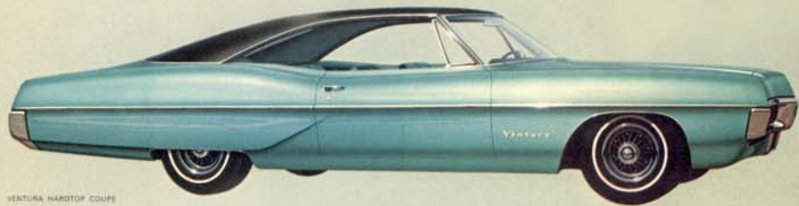
VENTURA HARDTOP COUPE