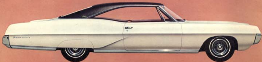
BONNEVILLE BROUGHAM HARDTOP COUPE

What can we tell you about Brougham after you've seen the previous pages? You already know it's the most elegantly styled Pontiac we've ever made. Yet its aristocratic lines barely hint at the unshamed luxury of its interiors. Feast your eyes on the sample below (those tasteful touches of expanded Morrokide are blended with sumptuous Plaza bolster cloth and Princessa pattern cloth), then consider such things as thick nylon blend carpeting, power windows (with controls in driver's armrest), new flexible door pulls, extra-thick foam seat padding, new Carpathian elm burl grain styling on door panels and dash, an electric clock, and a deluxe steering wheel. They're all standard. As is the Strato-bench front seat with free-standing center armrest. Luxurious? Luxurious. But that's hardly all. Brougham's standard 333-hp V-8 (325-hp with Turbo Hydra-Matic) will have to be experienced in the quick to be fully appreciated. And, of course, there's the supreme riding comfort you get only when you combine a long, 124-inch wheelbase with the road-hugging stability of Wide-Track.