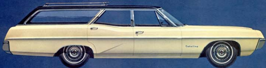
CATALINA 2-SEAT STATION WAGON

When we do something right, we really do it right. Our Catalina wagons are a perfect example. We take all the comfort, roominess, and acreage of our big wagon body, trim it with carpeting in the passenger area and vinyl in the cargo area, add an all Morrokide interior that looks like it came from a luxury car, offer it in two- and three-seat models, and then price it so low you'll think we made a mistake. No mistake. That's just the Pontiac way of doing things. In fact, the Catalina wagons also give you, at no extra cost, things normally left off cars that sell in this price range: wood grain styled instrument panel; lamps for the glove box, ashtray and cigar lighter; a standard 400 cubic inch engine of 265 hp that runs on regular gas, or a 290-hp premium gas version when you order Turbo Hydra-Matic.