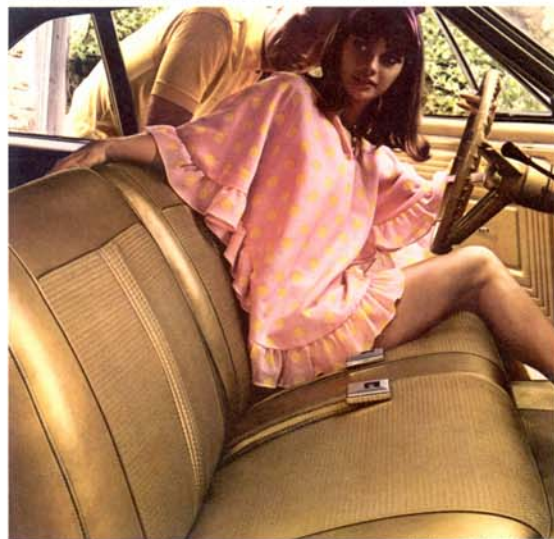
Shown on this car is this styling and some items from the many options and custom features offered by Pontiac on this basic car. They're available at extra cost and will vary.

Wishing to leave no stone unturned—and no buyer unconsidered—our engineers decided to see if they could make a car that would warm a Scrooge's heart yet be unmistakably a Pontiac. This was a tough order, considering all Pontiacs must look like Pontiacs, have Wide-Track, and a superlative power plant. But as you can see, they succeeded. The Tempest boasts a 165-hp Overhead Cam Six, and Paharra pattern cloth and Morrokide interiors. Or you can order a beautiful all-black all-Morrokide interior on the sports coupe at no extra cost. This is complemented by vinyl floor covering, a cigar lighter, courtesy lamps, padded dash, armrests, heater and defroster, dual-speed windshield wipers and washers—and don't forget, you can add the fabulous Sprint option to this, too. Pretty great, wouldn't you say?