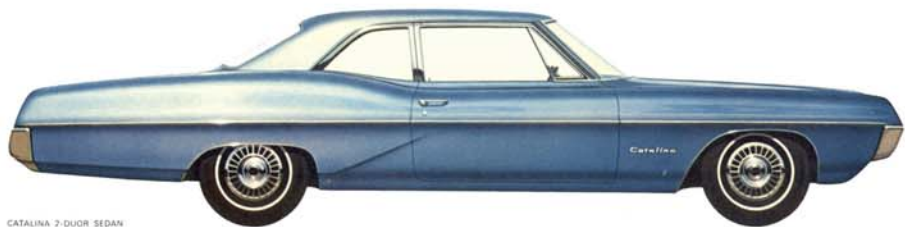
CATALINA 2-DOOR SEDAN