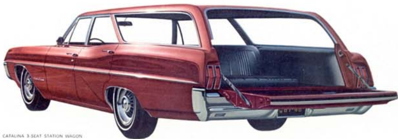
CATALINA 3-SEAT STATION WAGON