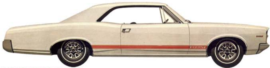
TEMPEST CUSTOM HARDTOP COUPE WITH SPRINT OPTION

This is the wonderful interloper that looks like it was designed in Italy, acts like a European road machine, and costs so little you'll think we left out the engine. Which, of course, we couldn't have because that outrageously efficient 215-hp Overhead Cam Six is the heart of it all—even if the car does corner like we did. The Sprint Option is available on all Le Mans, Tempest Customs, Tempests except station wagons. Interested? Who isn't. Turn the page.