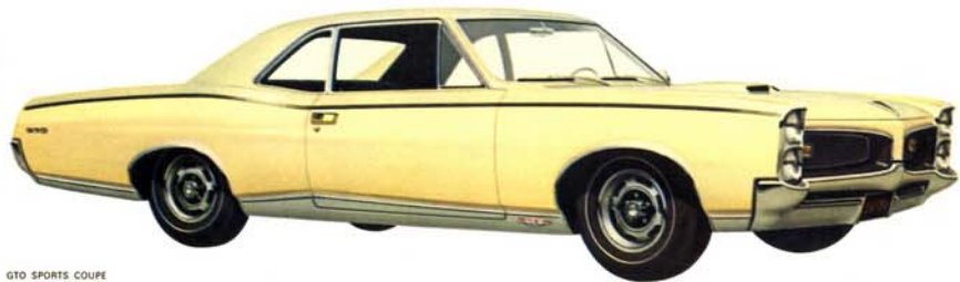
GTO SPORTS COUPE

This is The Great One. The ultimate driving machine. If you don't know what that means, you may be excused from this section of Wide Track country. But if suddenly you're aware of an almost uncontrollable urge to plant yourself behind the wheel of one of these automotive masterpieces, you have found your self a home. Turn to page 32 and then ask your Pontiac dealer for the special GTO Sprint 2 2 performance catalog and learn how beautiful life can really be.