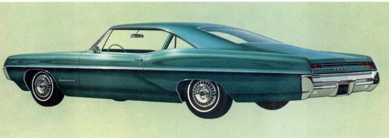
EXECUTIVE HARDTOP COUPE

Executive really offers you the best of several worlds. A world of luxury, certainly, as you will discover the first time you savor the plush comfort of its interiors. You may find it hard to decide whether you want fine Pristine pattern cloth with tasteful touches of expanded Morrokide or expanded Morrokide throughout—but either way the color will be keyed to complement the exterior. As will the nylon blend carpeting that runs door to door. A padded dash with walnut wood grain styling and a host of standard convenience features all contribute to a milieu that is the essence of style. Under the hood you'll find a world of excitement in the form of the standard 290-hp V-8 that comes with the Turbo Hydra-Matic. You can order up to 376 horses if you want more. Or you can order a regular fuel 265-hp version for a world of economy. But whichever Executive you order, the first thing you'll want to do is remove the price tag. Then no one will ever know.