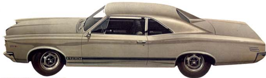
TEMPEST SPORTS COUPE WITH SPRINT OPTION