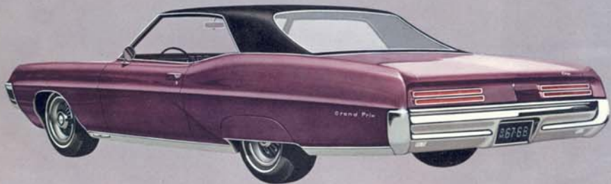
GRAND PRIX HARDTOP COUPE

Grand Prix has been setting the standard for personal luxury cars ever since it was introduced—and this year is no exception. A few good reasons why, you can see on these pages. Its monochromatic interior of expanded Morrokide comes in a choice of no less than seven beautiful colors. It's standard, of course. As are things like bucket seats, full nylon blend carpeting, Carpathian elm burl styling on dash and console, plus a whole slew of convenience features you'd expect to pay extra for. (You don't have to pay extra for the Strato-bench front seat with free-standing arm-rest on the hardtop coupe, but you have to give up the console. Decisions, decisions.) Your choice of power ranges all the way up to a 376-hp 428 cubic inch V-8, and options include everything from headrests to power seats and window lifts.