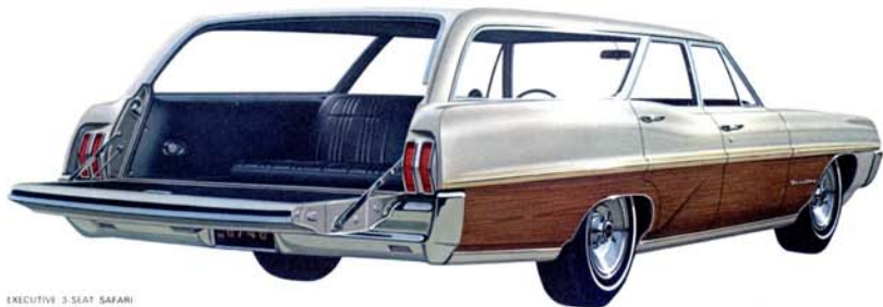
EXECUTIVE 3 SEAT SAFARI