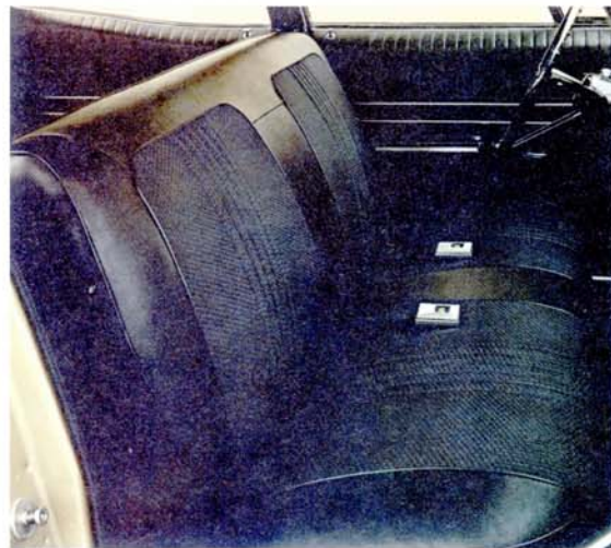
Shown in this car is the seating arrangement from the many options and custom features offered by Pontiac on the back seat. They're available at extra cost and well worth it.

When we do something right, we really do it right. Our Catalina wagons are a perfect example. We take all the comfort, roominess, and acreage of our big wagon body, trim it with carpeting in the passenger area and vinyl in the cargo area, add an all Morrokide interior that looks like it came from a luxury car, offer it in two- and three-seat models, and then price it so low you'll think we made a mistake. No mistake. That's just the Pontiac way of doing things. In fact, the Catalina wagons also give you, at no extra cost, things normally left off cars that sell in this price range: wood grain styled instrument panel; lamps for the glove box, ashtray and cigar lighter; a standard 400 cubic inch engine of 265 hp that runs on regular gas, or a 290-hp premium gas version when you order Turbo Hydra-Matic.