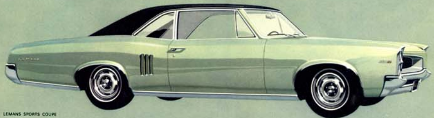
LEMANS SPORTS COUPE

The Le Mans convertible, hardtop and sports coupe, shown top to bottom, offer you a choice of bucket seats—in blue, turquoise, gold, black, parchment or red—or a notch-back front bench seat with center armrest in parchment or black, no extra cost! In the 4-door hardtop, you can decide between the Prevue pattern cloth and expanded Morrokide bench seats shown (black or blue) and a notch-back front seat with center armrest in expanded Morrokide (black, blue or gold) also at no extra cost. Therein lies the beauty of a Le Mans. Of course, don't forget about options. You can add the sprightly Sprint package (see page 33), a 250-hp regular gas V-8, a 285-hp premium gas V-8, a two-speed automatic transmission, and a number of comfort and convenience options that will turn your already luxurious automobile into a dream on wheels. Except that this dream is for real. But you'll find that out when you go Wide-Tracking in your Le Mans.