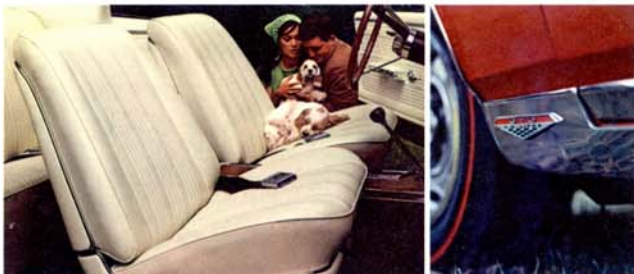
This all-expanded Morrokide interior is standard in blue, turquoise, gold, black, parchment or red. Or you can specify bench seats.

GTO is an idea on wheels—the idea that there's more to driving than moving from place to place in isolated indifference. Nevertheless, enough of the essence may be captured in words to create within the heart of the initiated an undying devotion to the Great One. The Great One is 400 cubic inches of chromed V-8, in 335- and 360-hp designations, an all-synchro three-speed, bucket seats, carpeting, paint striping, simulated walnut-grain instrument panel, dual exhausts, heavy-duty shocks, springs and stabilizer bar, red-line or whitewall tires, and an option list as long as your arm and twice as hairy—four-speed stick, 3-speed Turbo Hydra-Matic, 255-hp 2-bbl (with Turbo Hydra-Matic only), disc brakes, instrument package, special wheels—get the idea? Of course you do.