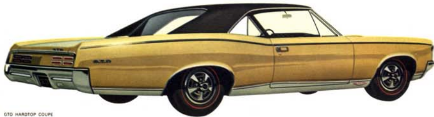
GTO HARDTOP COUPE