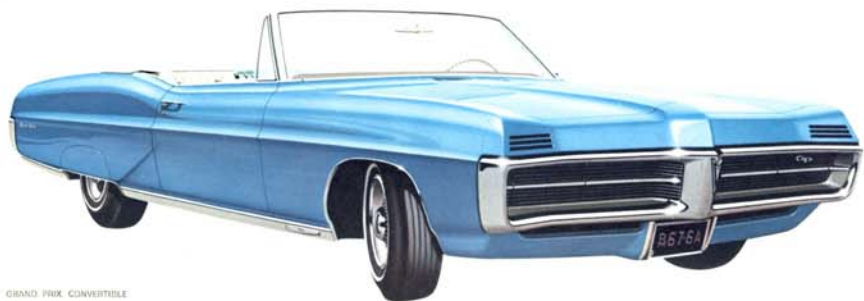
GRAND PRIX CONVERTIBLE