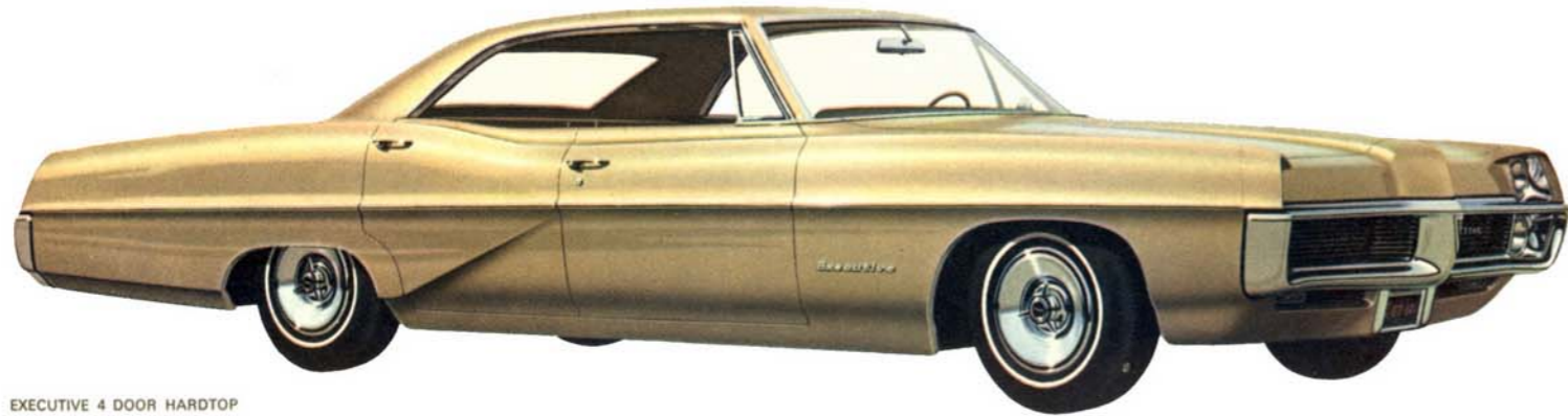
EXECUTIVE 4 DOOR HARDTOP