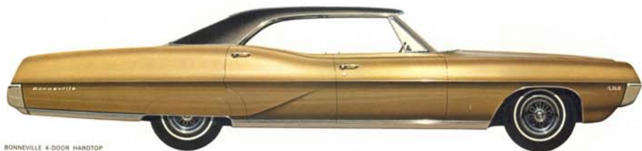
BONNEVILLE 4-DOOR HARDTOP