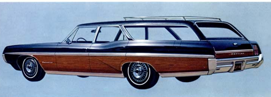
EXECUTIVE 2 SEAT SAFARI

Executive Safari is not only the newest of the Wide-Track wagons, it might well be the new wagon of the year. Its sleek long lines and distinctive simulated wood grain styling, its posh interiors and plentiful convenience features all come wrapped up in a price tag that's got to be the year's happiest surprise. Open a Safari and you'll find such things as wall-to-wall nylon blend carpeting, a walnut grained dash, an electric clock, plus that expanded Morrokide interior you see below. Open it up and its standard 265-hp regular fuel V-8 will prove that luxury can be a moving experience. Executive Safari is so much car, in fact, that we bring it to you in both 2- and 3-seat versions. Options? You can start with a luggage rack (if nearly 100 cubic feet of cargo space isn't enough) and go all the way to air conditioning. See our special wagon catalog for details.