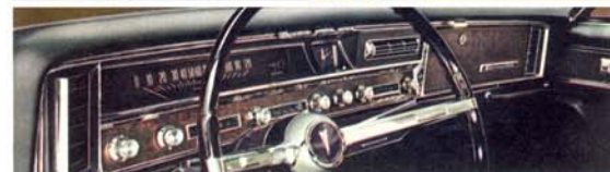
Shown on the left is 31-11. Upholstery and color items from the many softness and custom features offered by Pontiac on the back cover. They're available at extra cost and will apply to 2