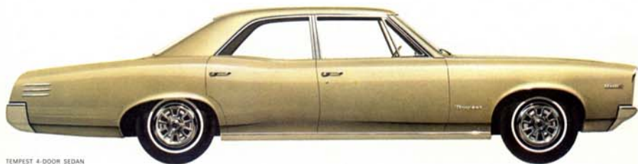
TEMPEST 4-DOOR SEDAN