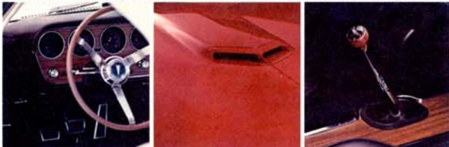
Wood-grain instrument panel is standard. You can order the Rally cluster gauge option.