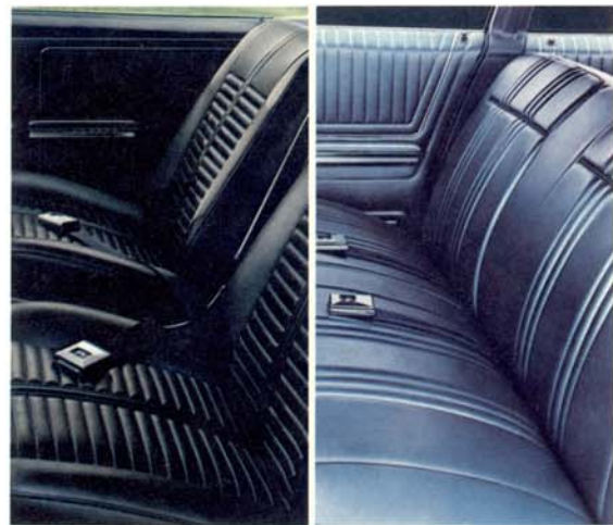
Shown on the cars on this catalog are some items from the more cost- and a slim features offered by Ford as on the back cover. They're not better at value and well worth.

Some of the standard luxury features that make Ventura Ventura you can see below and on the opposite page. They include such things as a custom-styled interior of expanded Morrokide (or a color-keyed combination of expanded Morrokide and rich Pristine pattern cloth), wall-to-wall carpeting of nylon blend loop pile, a padded dash with walnut wood grain styling, extra insulation, special emblems, and in the convertible and hardtop coupe: Strato-bucket seats. Of course, you needn't stop there. The list of options and accessories practically lets you design a Ventura to your own specifications. Ask your dealer.