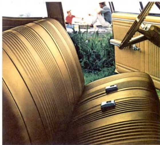
TEMPEST SAFARI AND STATION WAGONS

That elegant wagon with walnut wood grain styled paneling you see at the top of the page is our Tempest Safari, of which we are exceedingly proud. Where else can you get looks like this, an all Morrokide interior, nylon blend carpeting in the passenger area, and a revolutionary 165-hp Overhead Cam Six engine as standard equipment? Even the instrument panel has wood grained styling—and at these low prices! But if economy is more of a consideration, you'll want to look at our Tempest Custom. Same 165-hp OHC 6. Same superb Pontiac styling. Carpeting. All Morrokide interior. And, of course, there's our Tempest—the last word in quality with a price tag that has the honor of being the lowest in our Wide-Track wagon lineup. Really though, if you're a wagon fan, get a copy of our special wagon catalog and spend a few hours perusing it. It's a revelation.