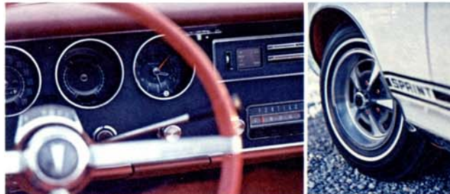
The Tempest Custom instrument panel with automatic Rally gauges may be ordered.

As we said, the heart of the Sprint option is the 215-hp Overhead Cam Six with its four-barrel Quadrajét carburetor, marked by a special chromed low-restriction air cleaner. In addition you get heavy-duty front shocks, springs, and stabilizer bar, all-synchro floor-mounted stick shift, special 3.55:1 axle ratio (3.23:1 with automatic), chromed wheel openings, distinctive sports striping on all coupe models, and the word "Sprint" inserted in the striping just behind the front wheel. But naturally, this is just a great beginning. The true aficionado will take it from there and add things like front-wheel disc brakes, rally wheels, all-synchro four-speed, hood-mounted tachometer, rally cluster, headrests. If this sounds appealing to you (and it should if you have the normal supply of red corpuscles) ask your dealer for the GTO/2+2/Sprint Performance Catalog.