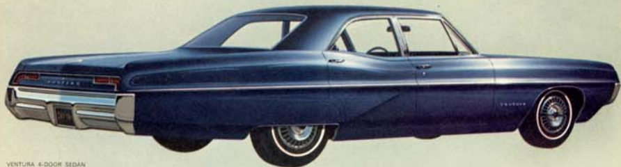
VENTURA 4-DOOR SEDAN

Some of the standard luxury features that make Ventura Ventura you can see below and on the opposite page. They include such things as a custom-styled interior of expanded Morrokide (or a color-keyed combination of expanded Morrokide and rich Pristine pattern cloth), wall-to-wall carpeting of nylon blend loop pile, a padded dash with walnut wood grain styling, extra insulation, special emblems, and in the convertible and hardtop coupe: Strato-bucket seats. Of course, you needn't stop there. The list of options and accessories practically lets you design a Ventura to your own specifications. Ask your dealer.