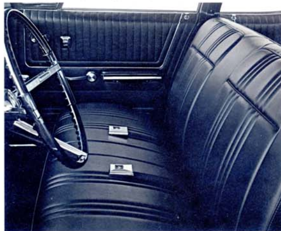
EXECUTIVE SAFARI STATION WAGON

Executive Safari is not only the newest of the Wide-Track wagons, it might well be the new wagon of the year. Its sleek long lines and distinctive simulated wood grain styling, its posh interiors and plentiful convenience features all come wrapped up in a price tag that's got to be the year's happiest surprise. Open a Safari and you'll find such things as wall-to-wall nylon blend carpeting, a walnut grained dash, an electric clock, plus that expanded Morrokide interior you see below. Open it up and its standard 265-hp regular fuel V-8 will prove that luxury can be a moving experience. Executive Safari is so much car, in fact, that we bring it to you in both 2- and 3-seat versions. Options? You can start with a luggage rack (if nearly 100 cubic feet of cargo space isn't enough) and go all the way to air conditioning. See our special wagon catalog for details.