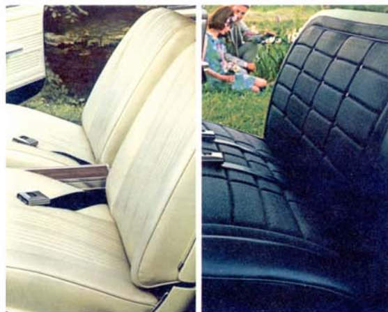
(Shown on the cars in this catalog are some items from the many options and custom features offered by Pontiac on the back cover. They're available at extra cost and well worth it.)

The Le Mans convertible, hardtop and sports coupe, shown top to bottom, offer you a choice of bucket seats—in blue, turquoise, gold, black, parchment or red—or a notch-back front bench seat with center armrest in parchment or black, no extra cost! In the 4-door hardtop, you can decide between the Prevue pattern cloth and expanded Morrokide bench seats shown (black or blue) and a notch-back front seat with center armrest in expanded Morrokide (black, blue or gold) also at no extra cost. Therein lies the beauty of a Le Mans. Of course, don't forget about options. You can add the sprightly Sprint package (see page 33), a 250-hp regular gas V-8, a 285-hp premium gas V-8, a two-speed automatic transmission, and a number of comfort and convenience options that will turn your already luxurious automobile into a dream on wheels. Except that this dream is for real. But you'll find that out when you go Wide-Tracking in your Le Mans.