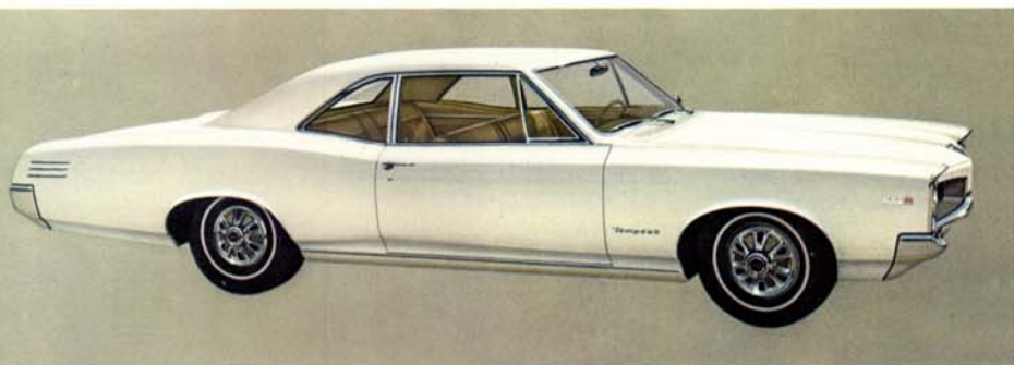
TEMPEST SPORTS COUPE

Wishing to leave no stone unturned—and no buyer unconsidered—our engineers decided to see if they could make a car that would warm a Scrooge's heart yet be unmistakably a Pontiac. This was a tough order, considering all Pontiacs must look like Pontiacs, have Wide-Track, and a superlative power plant. But as you can see, they succeeded. The Tempest boasts a 165-hp Overhead Cam Six, and Paharra pattern cloth and Morrokide interiors. Or you can order a beautiful all-black all-Morrokide interior on the sports coupe at no extra cost. This is complemented by vinyl floor covering, a cigar lighter, courtesy lamps, padded dash, armrests, heater and defroster, dual-speed windshield wipers and washers—and don't forget, you can add the fabulous Sprint option to this, too. Pretty great, wouldn't you say?