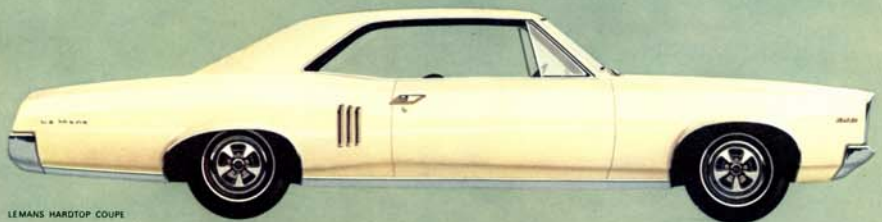
LEMANS HARDTOP COUPE