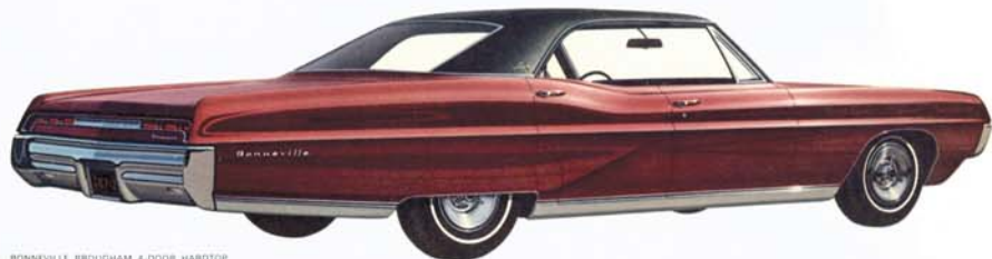
BONNEVILLE BROUGHAM 4-DOOR HARDTOP