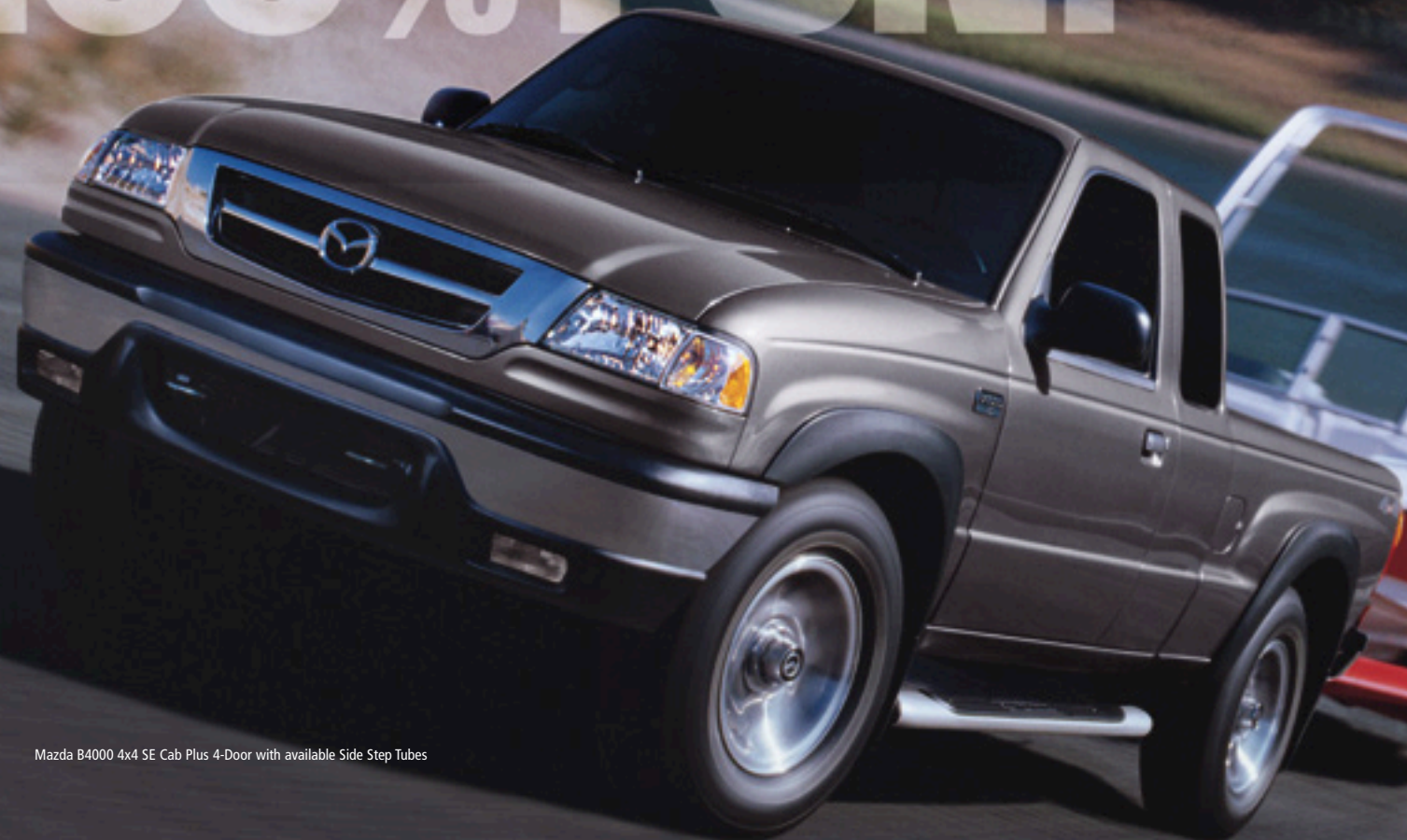
Mazda B4000 4x4 SE Cab Plus 4-Door with available Side Step Tubes

Want 4x4 versatility and tons of towing talent? Then you want a Mazda B4000 4x4 SE Cab Plus 4-Door. You'll enjoy a gutsy 4.0-liter V6 that generates 207 hp and 238 lb-ft of torque. An electronically controlled 5-speed automatic. The ability to shift on the fly into 4x4 mode (up to 45 mph). A maximum towing capacity of 5580 lbs. Striking 16-inch alloy wheels surrounded by beefy P255/70R16 all-terrain rubber. Fog lights and a protective bedliner. Even a frame-mounted trailer-hitch receiver. So climb into a Mazda B4000 cab today. And make the whole planet your playground.