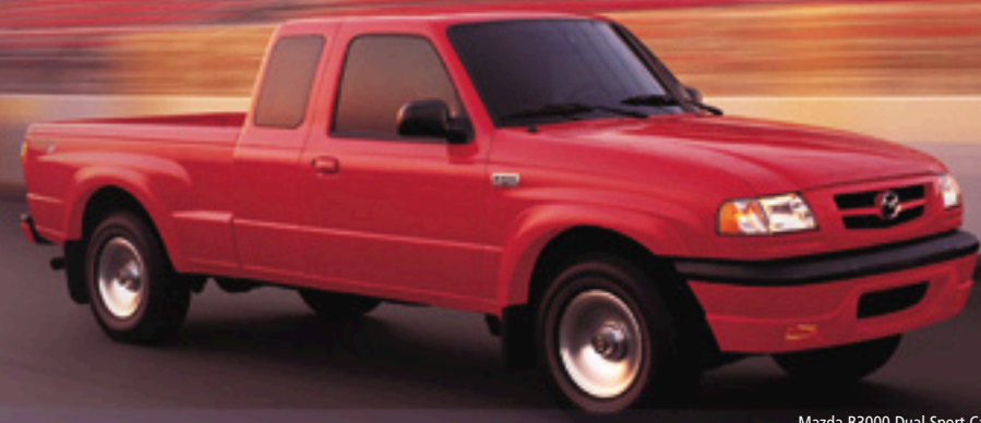
Mazda B3000 Dual Sport Cab Plus 4-Door

There's a Mazda B-Series Truck to provide power for any purpose. Take the Mazda B3000 Dual Sport Cab Plus 4-Door. It serves up a spirited, 3.0-liter V6 that churns out 148 hp and 180 lb-ft of torque. Aggressive P235/75R15 all-terrain tires. Gleaming 15-inch alloys. An AM/FM/CD stereo. The luxury of power windows, mirrors and door locks. And, like all Mazda trucks, the added confidence and security of a 4-wheel Anti-lock Brake System (ABS). This bad boy may run on gas, but it's fueled by testosterone.