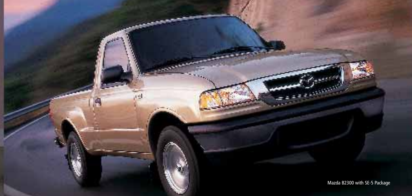
Mazda B2300 with SE-5 Package