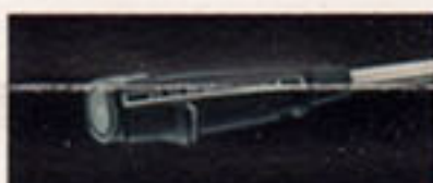
Optional speed control.