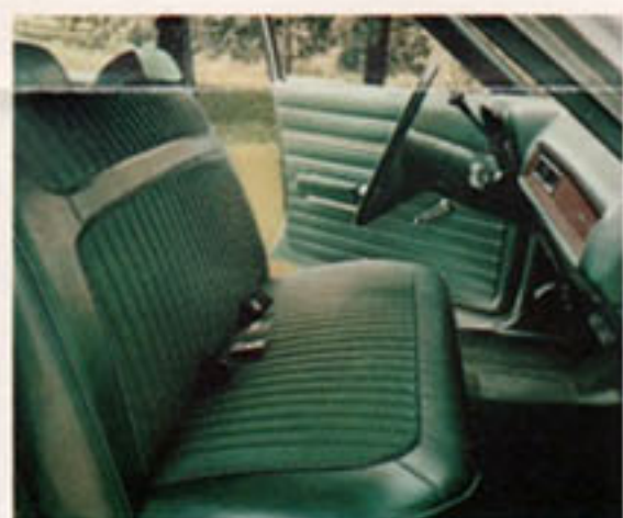
Coronet Custom's standard Prelude cloth-and-vinyl bench seat.

TRAILER-TOWING PACKAGES : See back cover.