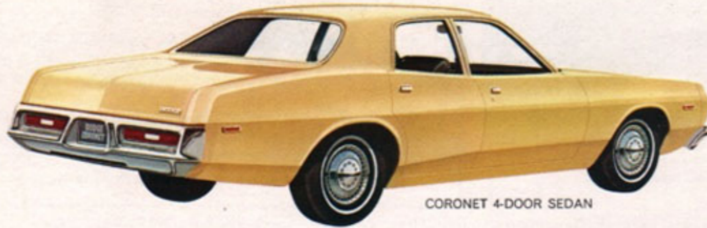
CORONET 4-DOOR SEDAN