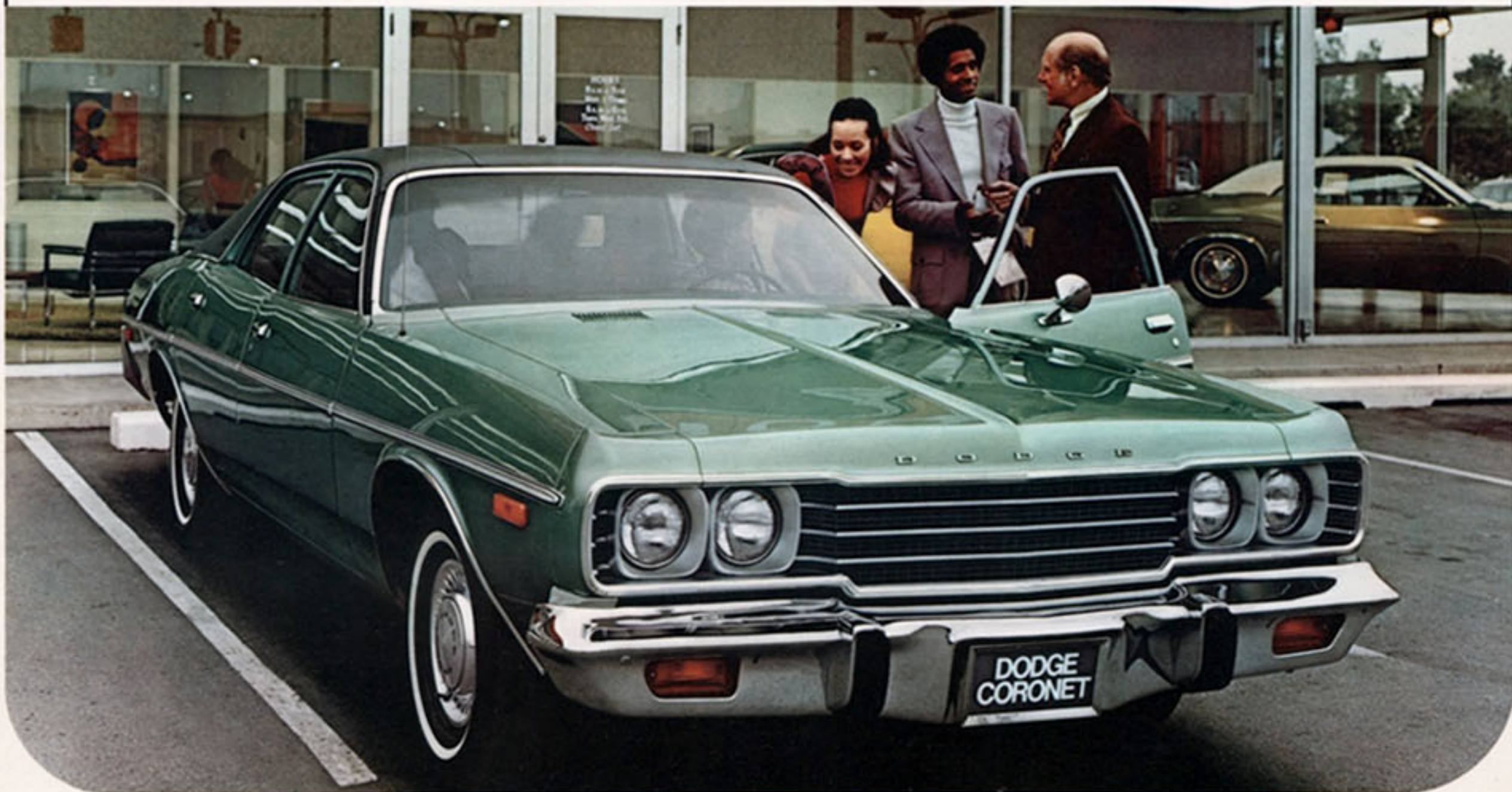
CORONET CUSTOM 4-DOOR SEDAN

bar suspension, Unibody construction, and Electronic Ignition are also standard on every 1974 Coronet. Check its size—check its interior appointments—check its price. See for yourself why some people call it the ideal family man's car.