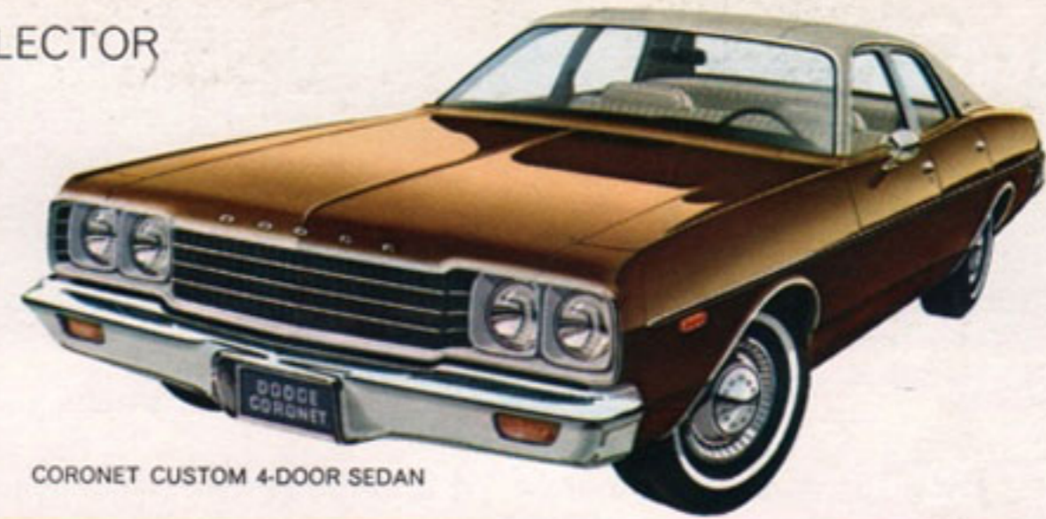
CORONET CUSTOM 4-DOOR SEDAN

There are important engineering differences offered in every Dodge car made in this country. Differences that are basic to the way we build our cars. Differences that could help you choose your next car.