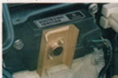
Electronic Ignition for up to 35% more starting voltage.

As a family car, Coronet '74 is well worth looking into . . . because it was designed to be a four-door sedan only. Coronet gives you ample interior room for six passengers and trunk space of most generous proportions without a bulky look. Torsion-