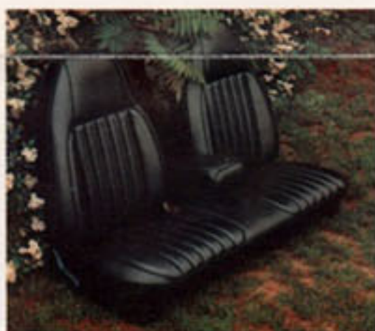
Coronet Custom's optional all-vinyl front bench seat with fold-down center armrest.