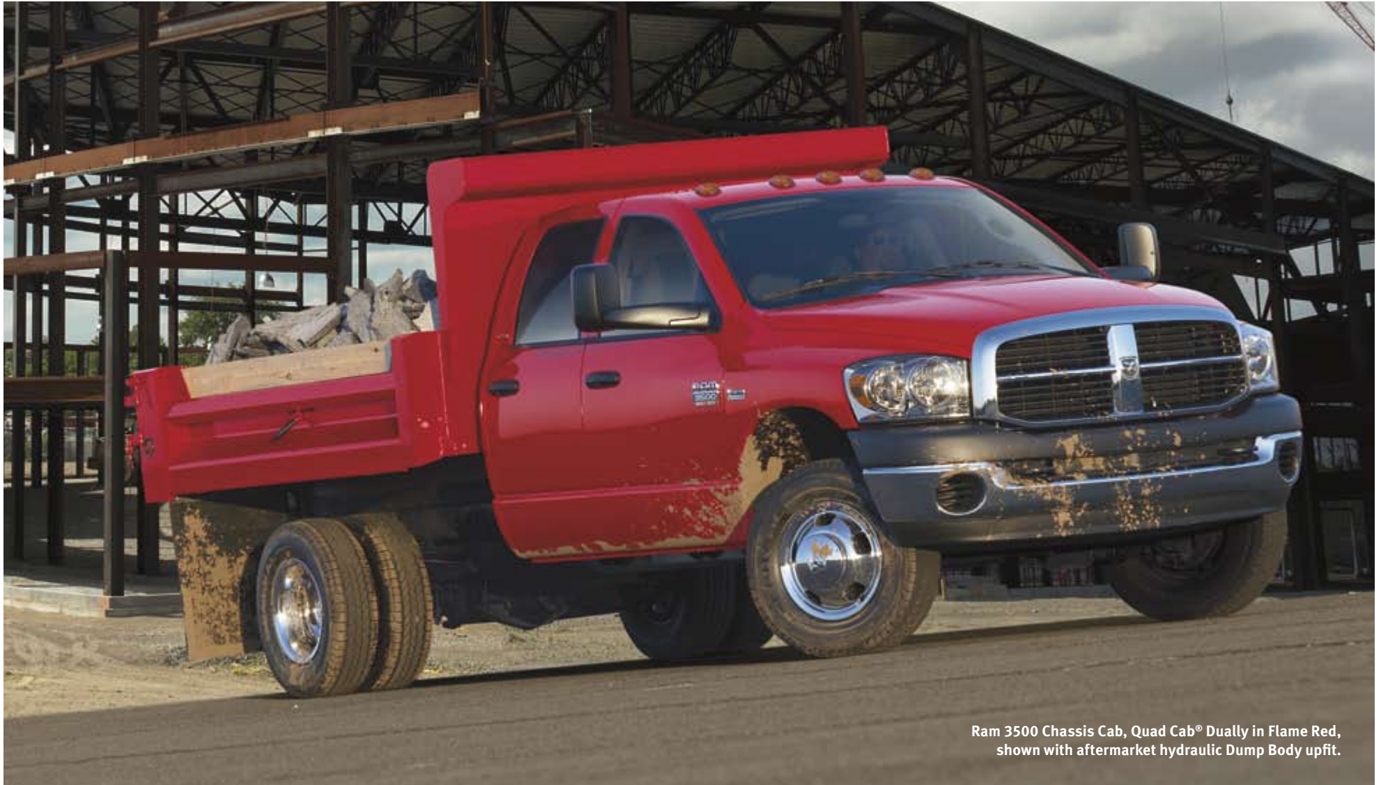
Ram 3500 Chassis Cab, Quad Cab® Dually in Flame Red, shown with aftermarket hydraulic Dump Body upfit.

THEY'RE MADE TO BE REMADE WITH THE UPFIT THAT MAKES YOUR BUSINESS FLY. THEY OFFER UNCOMMON CAPABILITY ON THE JOB, AND OUTSTANDING RELIABILITY WHILE GETTING THERE AND BACK. MEET THE 2009 RAM 3500 CHASSIS CABS.