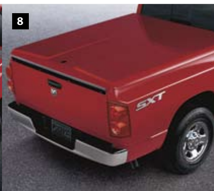
Fiberglass Tonneau Cover