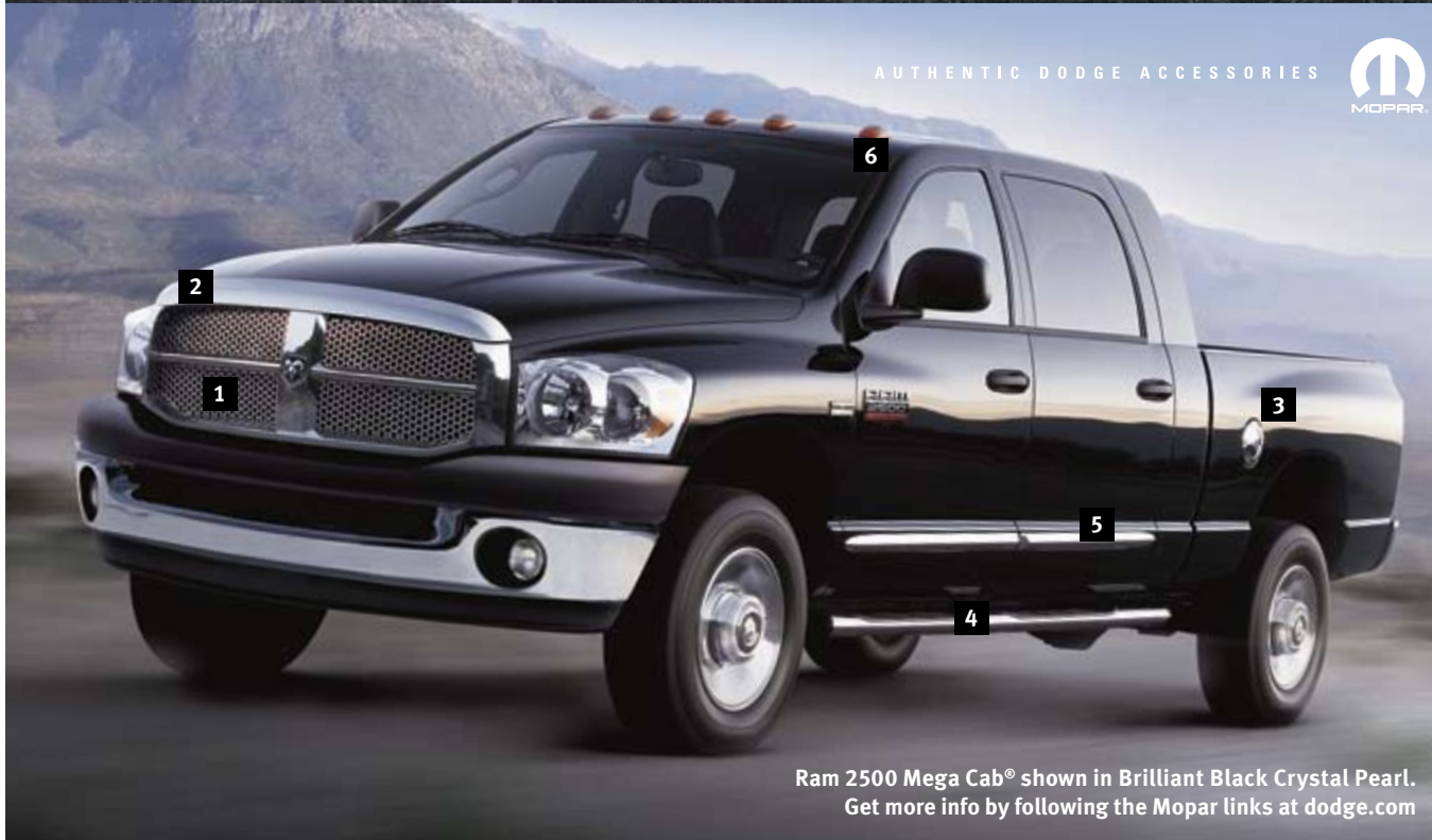
Ram 2500 Mega Cab® shown in Brilliant Black Crystal Pearl. Get more info by following the Mopar links at dodge.com

WHETHER YOU USE YOUR RAM HEAVY DUTY FOR WORK OR PLAY, GRAB EVERY COMFORT AND CONVENIENCE YOU CAN — WITH AUTHENTIC DODGE ACCESSORIES BY MOPAR.