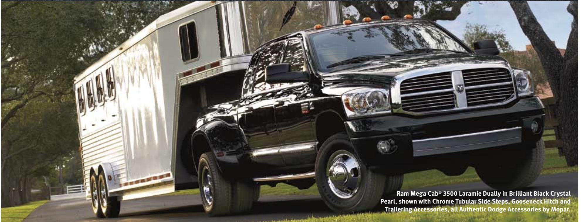
Ram Mega Cab® 3500 Laramie Dually in Brilliant Black Crystal Pearl, shown with Chrome Tubular Side Steps, Gooseneck Hitch and Trailering Accessories, all Authentic Dodge Accessories by Mopar.

FROM THE OUTSTANDING EQUIPMENT LEVEL OF RAM POWER WAGON® TO THE SPACIOUSNESS OF A RAM 3500 MEGA CAB® DUALY, THIS IS THE FAMILY YOU NEED WHEN ONLY THE BEST WILL DO: 2009 RAM HEAVY DUTY.