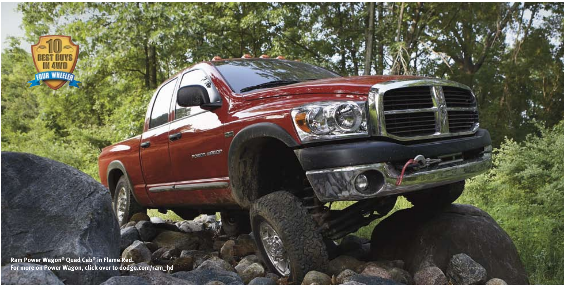
Ram Power Wagon® Quad Cab® in Flame Red. For more on Power Wagon, click over to dodge.com/ram_hd