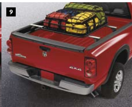
Bed-Mount Cargo Basket

7 UNDER-THE-RAIL BEDLINER. Help protect your truck's bed floor and bed rails with this high-density polyethylene Skid Resistor bedliner.