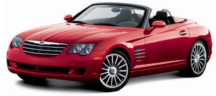
Crossfire Roadster Special Edition in Inferno Red Crystal Pearl

Crossfire performance has been validated on Europe's famed Nurburgring racetrack. The art-deco design has been applauded around the world. Its rear-wheel drive and standard six-speed manual transmission make every drive memorable. Electric-powered rear spoiler, antilock brakes (ABS) with Brake Assist, Electronic Throttle Control, Electronic Stability Program (ESP), all-speed traction control and available Tire Pressure Monitoring System are fully integrated to help ensure that you are in control of virtually any driving situation.