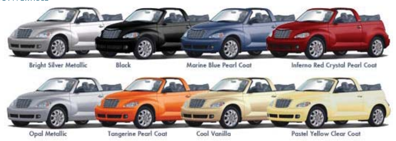
Not all models are available in all colors.