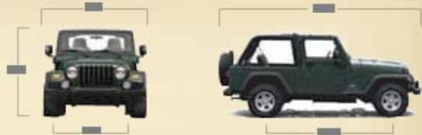
Jeep, Wrangler Unlimited shown

All product illustrations, specifications and competitive comparisons are based upon current information at the time of publication approval. Although descriptions are believed correct, complete accuracy cannot be guaranteed. DaimlerChrysler reserves the right to make changes at any time, without notice or obligation, in prices, specifications, equipment, colors and materials, and to change or discontinue models. Some of the equipment shown or described throughout this catalog is available at extra cost. Available in U.S. markets only. See your dealer for the latest information.