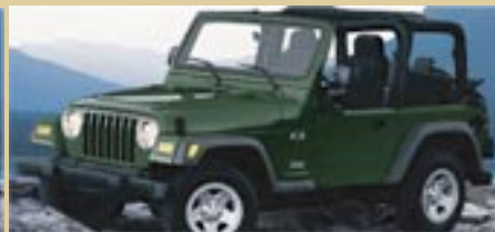
Deep Beryl Green