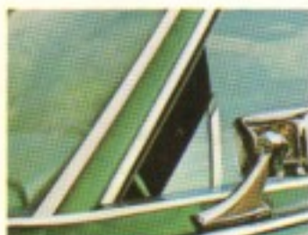
Power Vent Window