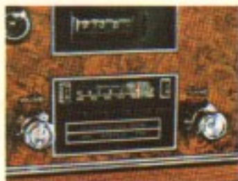
AM/FM/MPX Radio with Quad-8 Tape Player