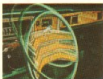
Tilt Steering Wheel