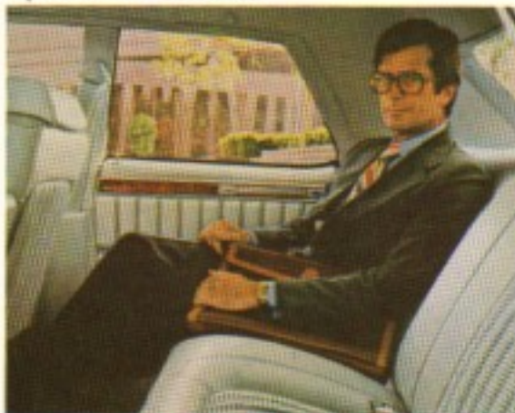
Spacious rear seat area