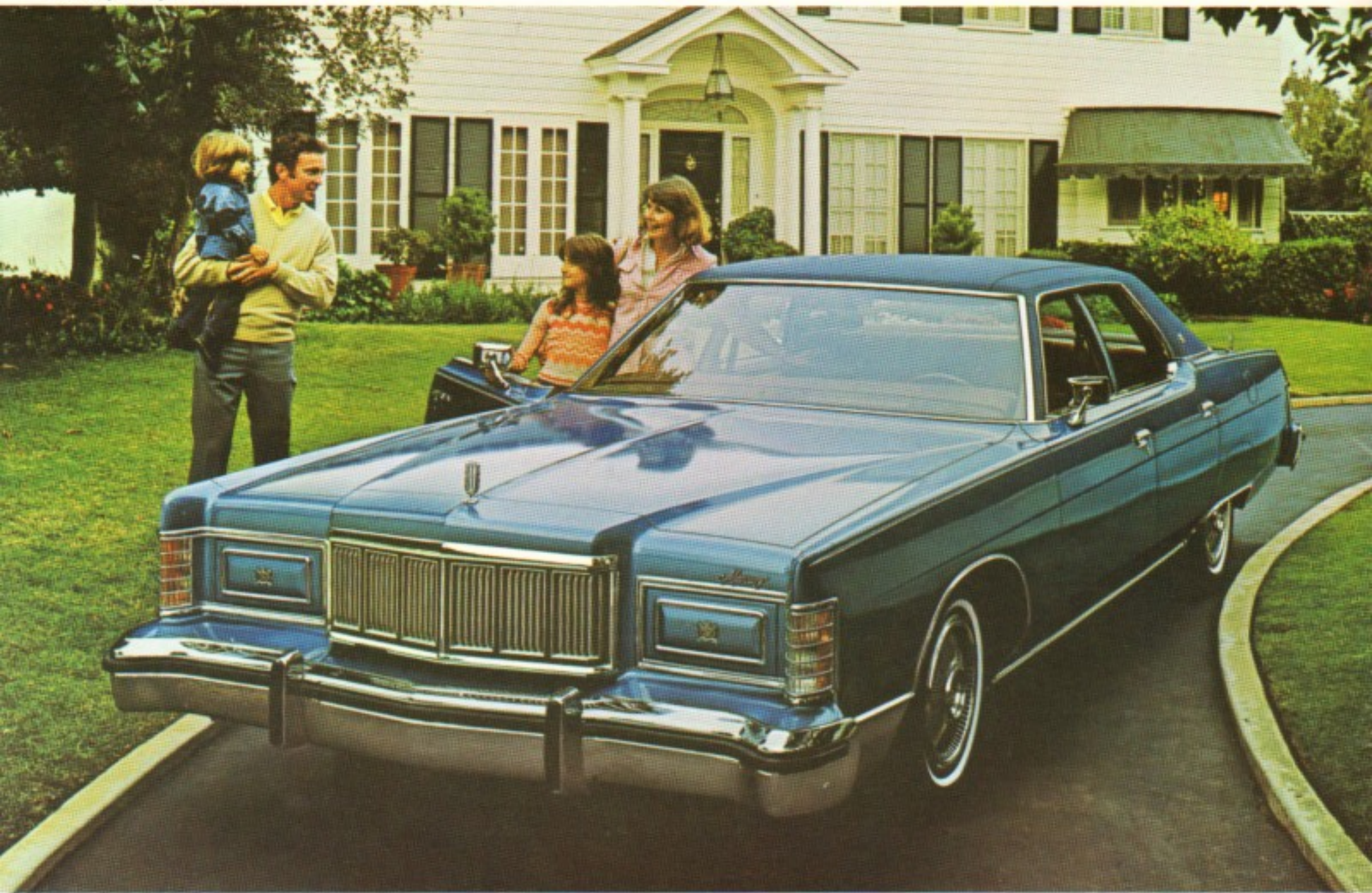
Mercury Marquis 4-door