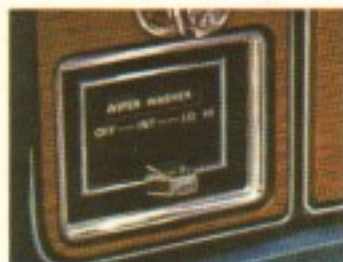
Interval Wiper Control