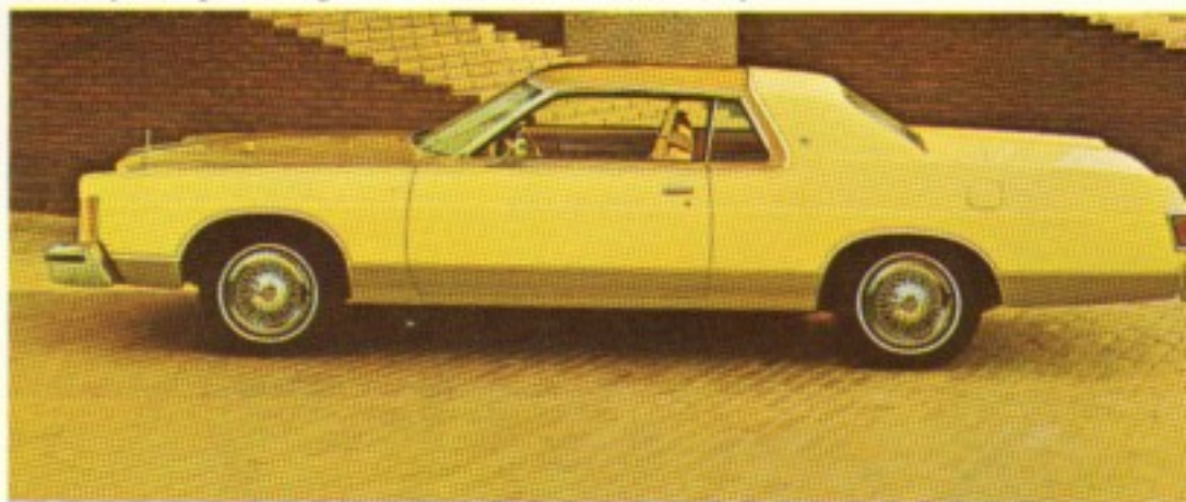
Mercury Marquis Brougham 2-door with Tu-Tone Group.

Mercury Marquis Brougham: stunning looks and stylish lines tell only half the story. Underpinning it all are hidden strengths, engineered attributes contributing to the solid substance and overall feeling you get driving this superbly riding car. To help preserve these built-in strengths and conserve the long-term value of your purchase, we've added new corrosion protection in major areas of the body. Just one more example of the engineering advancements and concern for quality that make ownership of a Mercury such an assured pleasure. Great styling, an ongoing concern for solid engineering, an admirably smooth and secure ride. These are standard on every Mercury—product of the ride specialists. Shown, above right, is the Marquis Brougham with the Tu-Tone Group in cream and medium gold metallic. Shown below is the standard Marquis Brougham interior in saddle Willshire cloth and vinyl, also available in dark red, medium blue, gold or jade. A Twin Comfort Lounge seat may be ordered as an option, either in cloth-and-vinyl or all-vinyl, in the same broad choice of colors. And, as with all Mercurys, you can further select from an exciting list of options on the back cover of this booklet to add custom accents of your own.