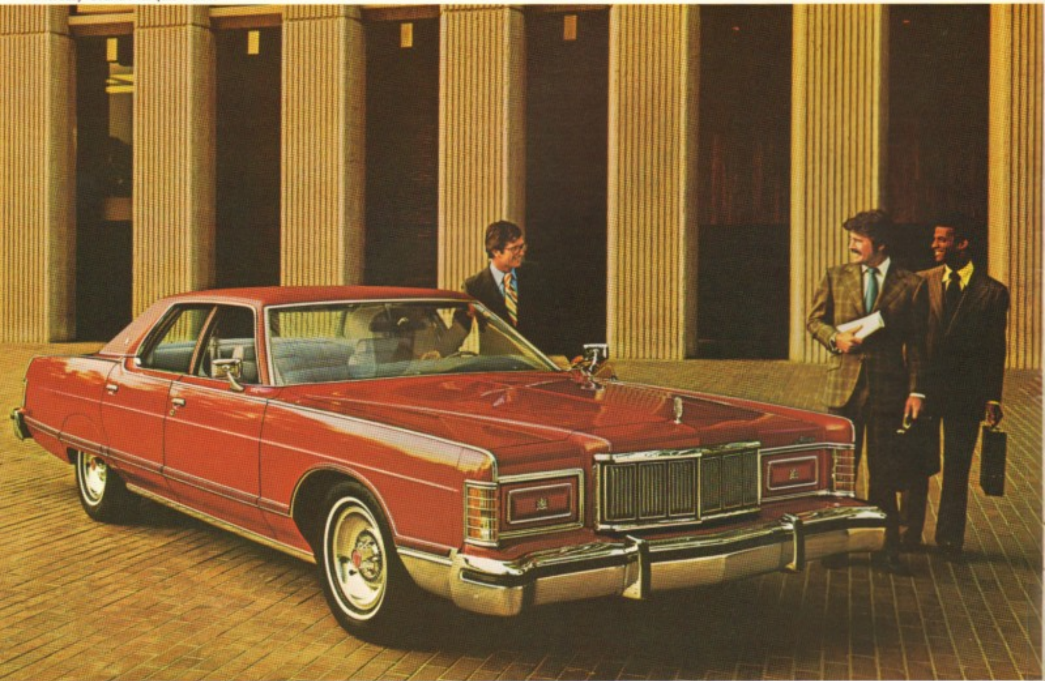
Mercury Grand Marquis 4-door