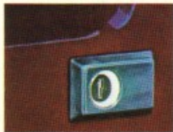
Illuminated Entry System