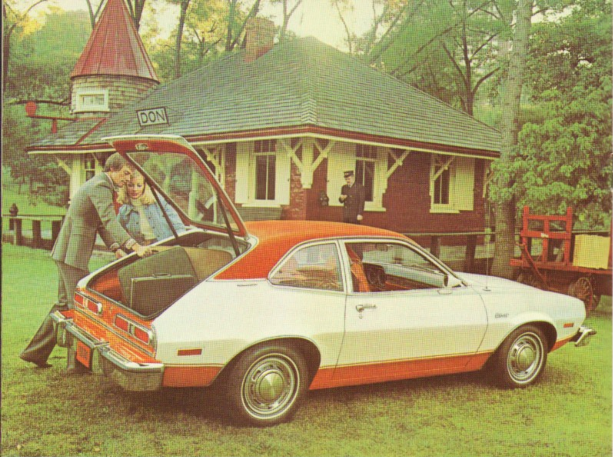
Above: Mercury Bobcat 3-door Runabout with Sports Accent Group option. Below: Mercury Bobcat 3-door Runabout with optional Accent Group.