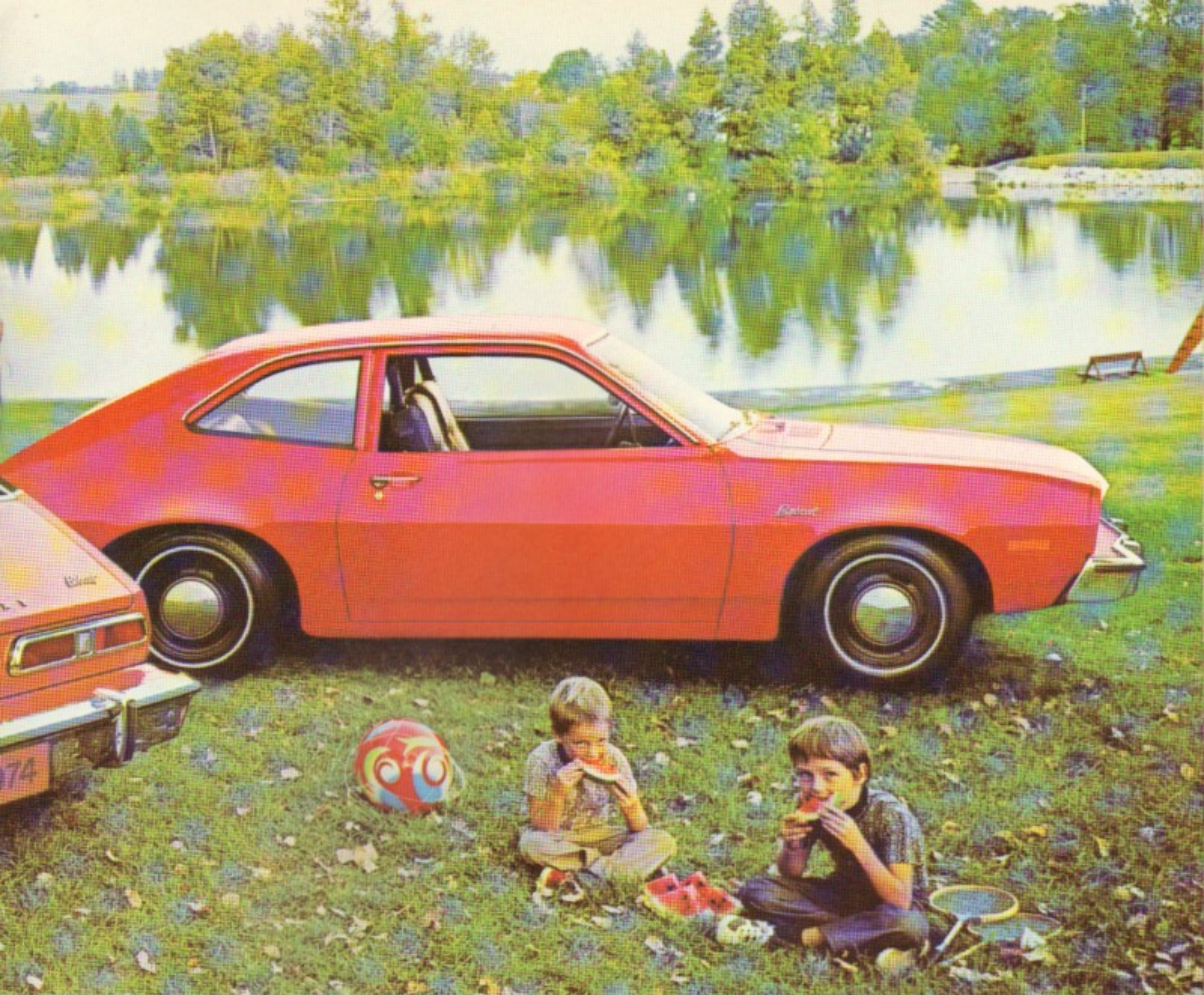
Above right: Mercury Bobcat 2-door sedan with optional whitewall tires.