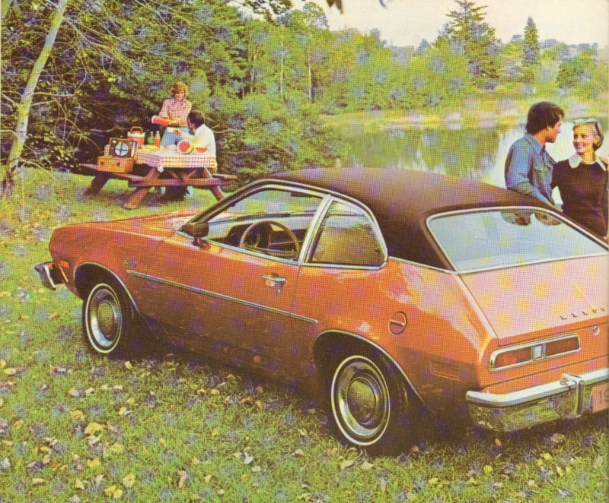
Above left: Mercury Bobcat 2-door sedan with optional vinyl roof, trim rings/hub caps, Value Option Package and Deluxe Bumper Group.