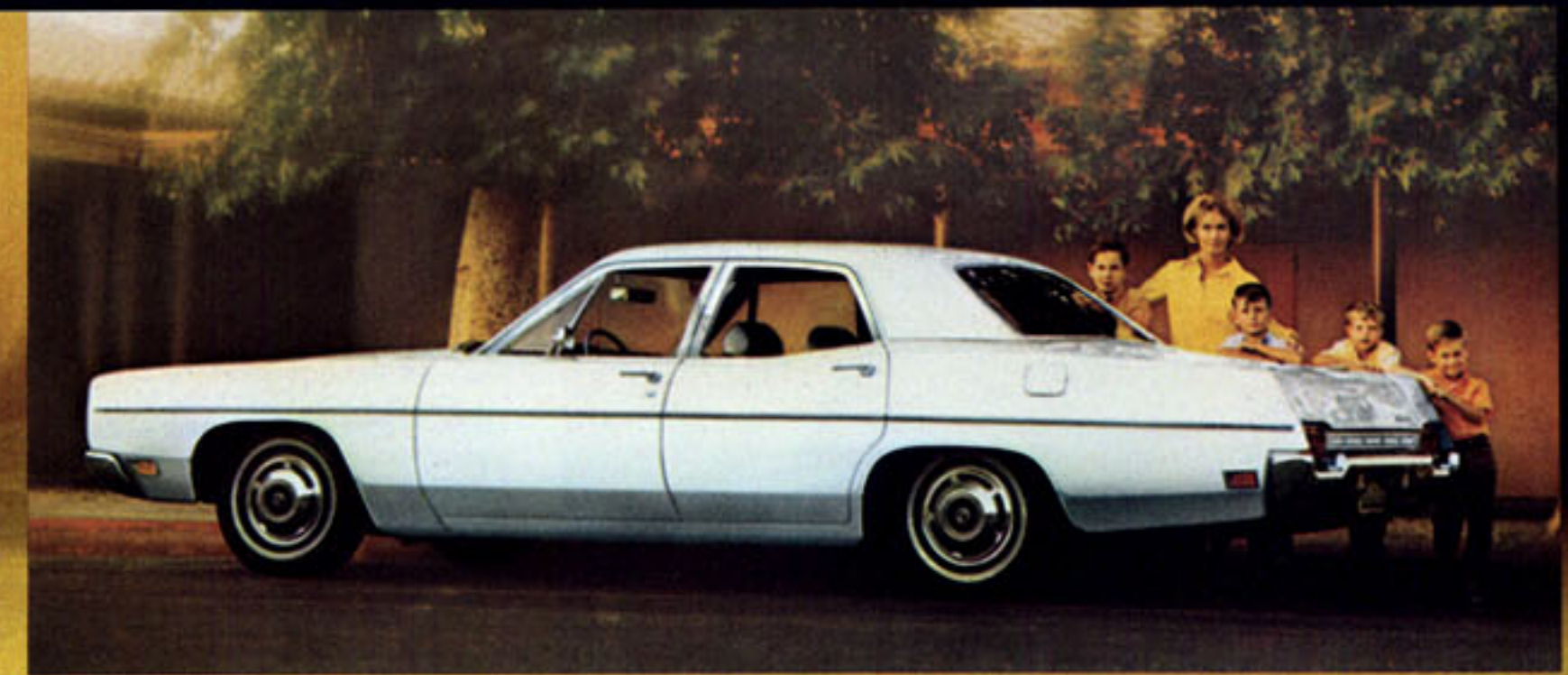
GALAXIE 500 4-DOOR SEDAN