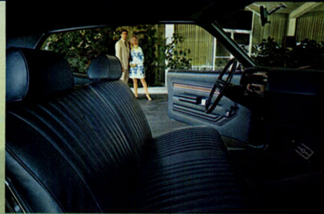
FORD'S FRONT ROOM, A BETTER IDEA THAT GIVES YOU HOME COMFORT, IN ELEGANT CLOTH-AND-VINYL OR OPTIONAL ALL-VINYL TRIM

Galaxie's fine-car style and luxury give you a ride as quiet as the LTD. Drive a Galaxie soon and see.