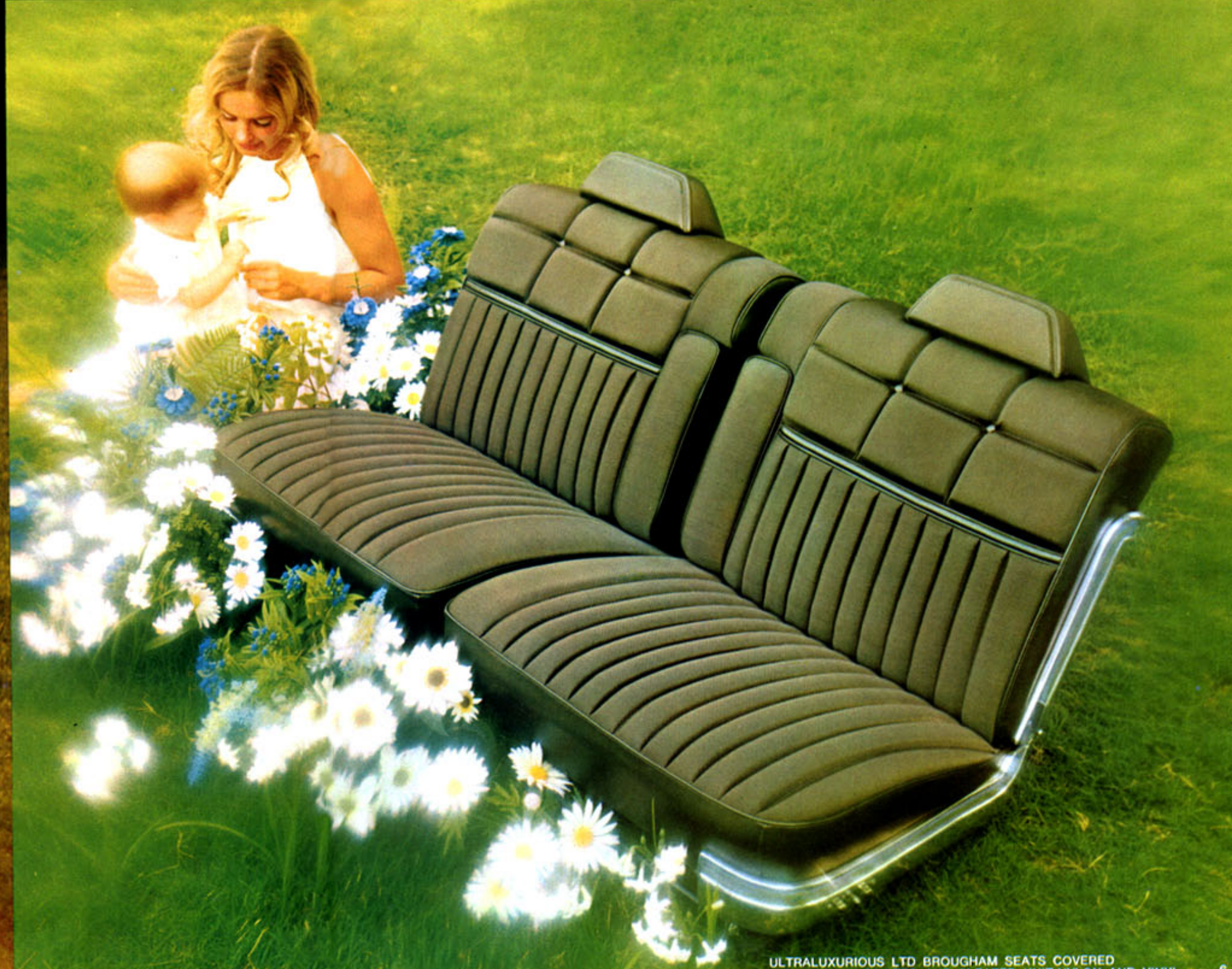
ULTRALUXURIOUS LTD BROUGHAM SEATS COVERED WITH RICHLY QUILTED AND PLEATED KNIT-NYLON AND VINYL