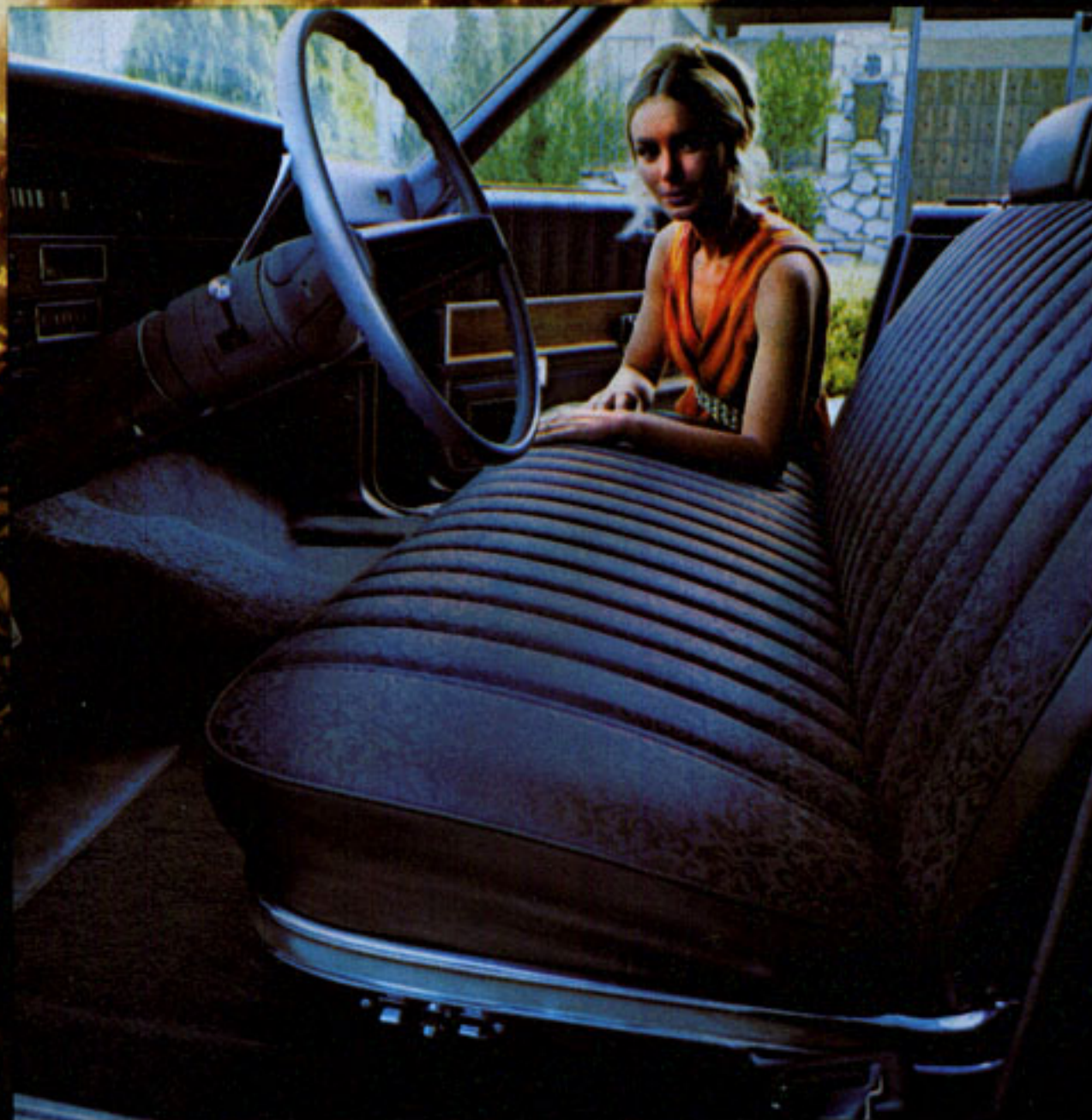
OPTIONAL LTD LUXURY TRIM — OPULENT ELEGANCE OF PLEATED BROCADE AND VINYL WITH WOODTONE ACCENTS, ELECTRIC CLOCK, AND MORE

LTD by Ford—most popular luxury-size Ford, and luxury leader in the low price class—puts fine-car ownership well within reach of virtually everyone. Like the all-new LTD Brougham series, there are three LTD choices: 4-door sedan (shown at left), 4-door hardtop (next page), a 2-door hardtop and two luxurious LTD Country Squire station wagons.