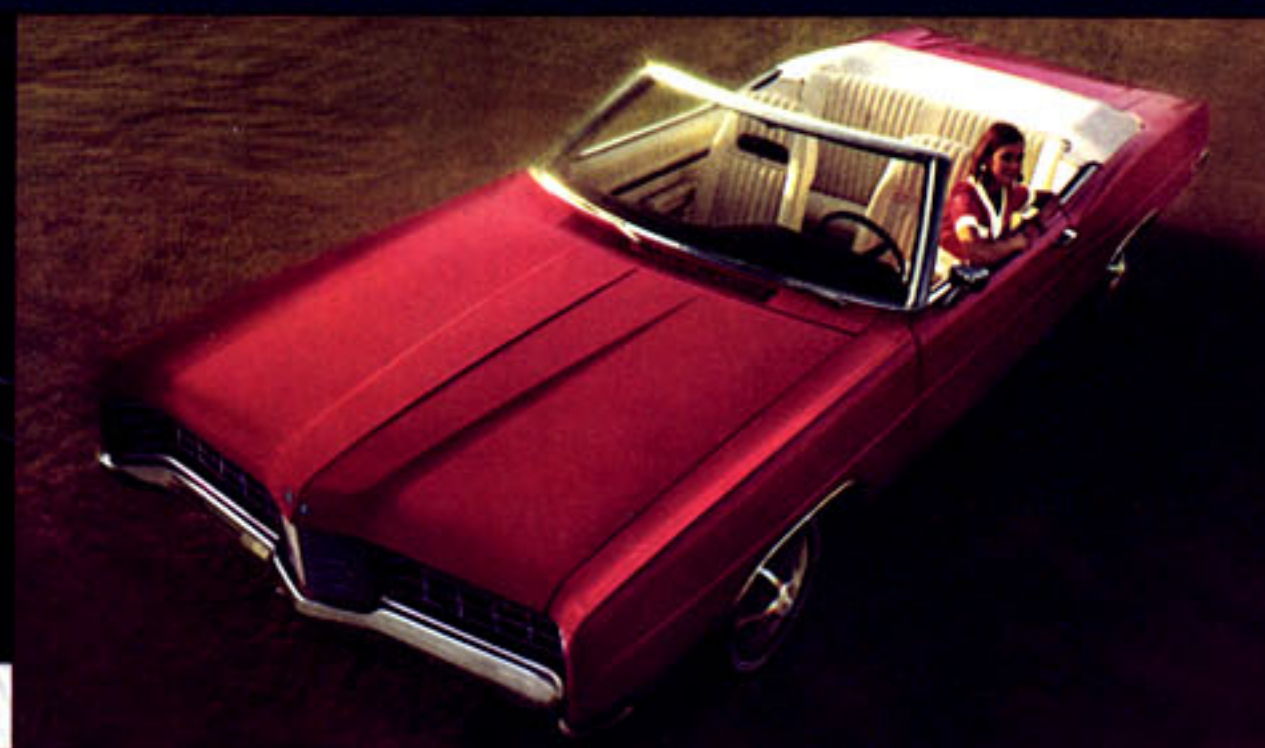
FORD XL CONVERTIBLE. NEW TOP DESIGN PERMITS FULL-WIDTH REAR SEAT, POWER TOP, STANDARD, HAS GLASS BACKLITE