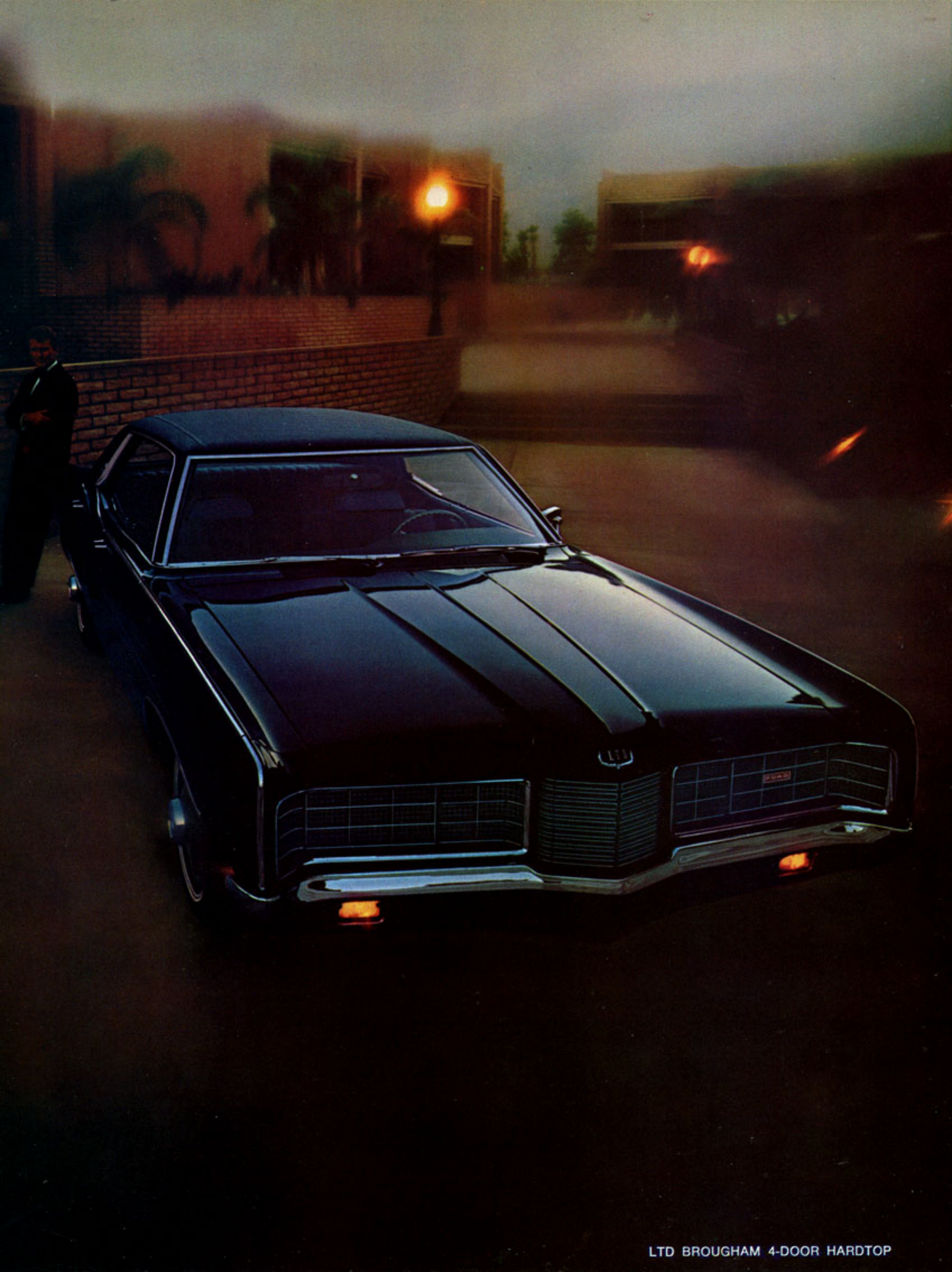
LTD BROUGHAM 4-DOOR HARDTOP