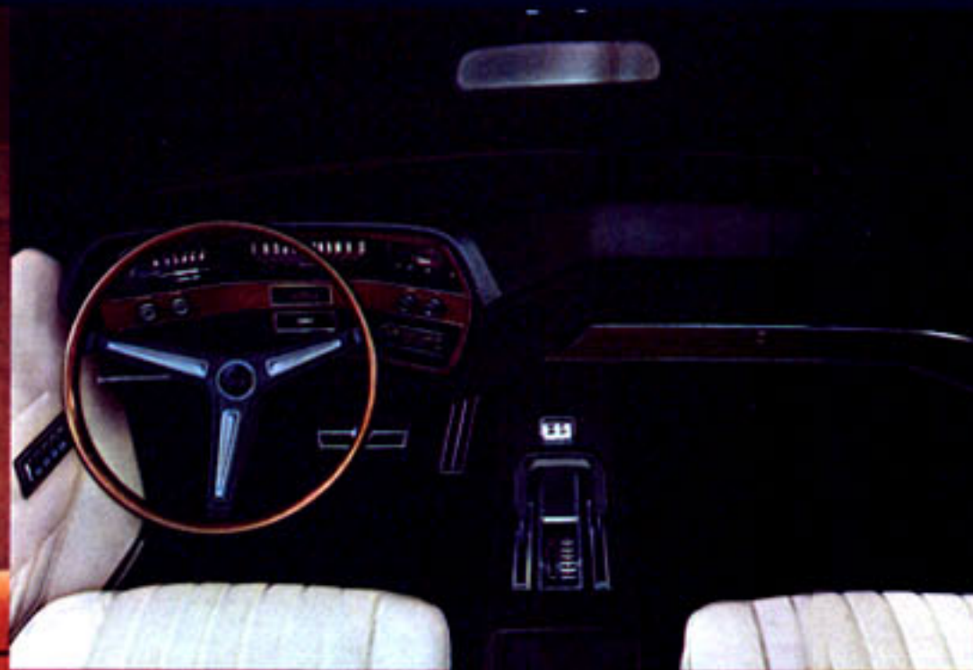
FLIGHT-COCKPIT INSTRUMENT PANEL MAKES CONTROLS MORE ACCESSIBLE, PROVIDES MORE PASSENGER ROOM