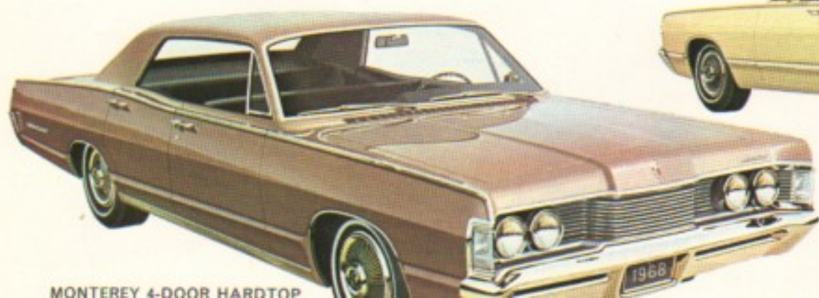
MONTEREY 4-DOOR HARDTOP