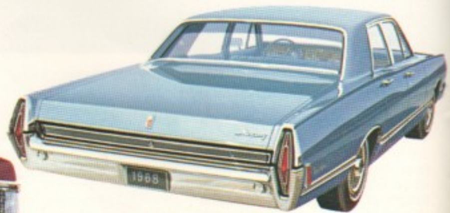
PARK LANE 4-DOOR SEDAN (STANDARD EQUIPMENT LISTED ON PAGES 12-13)