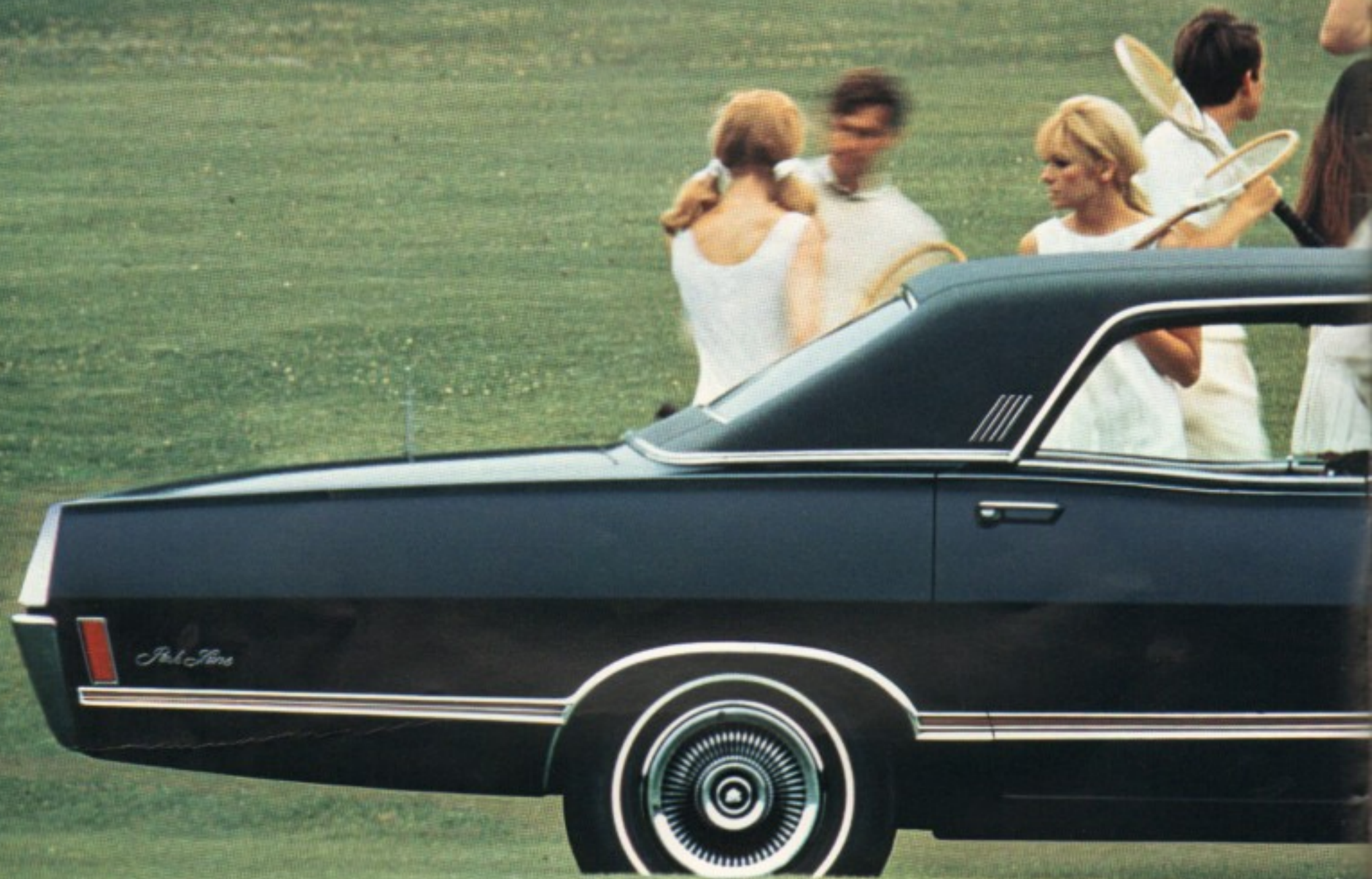
MONTCLAIR 4-DOOR HARDTOP (STANDARD EQUIPMENT LISTED ON PAGES 14-15)