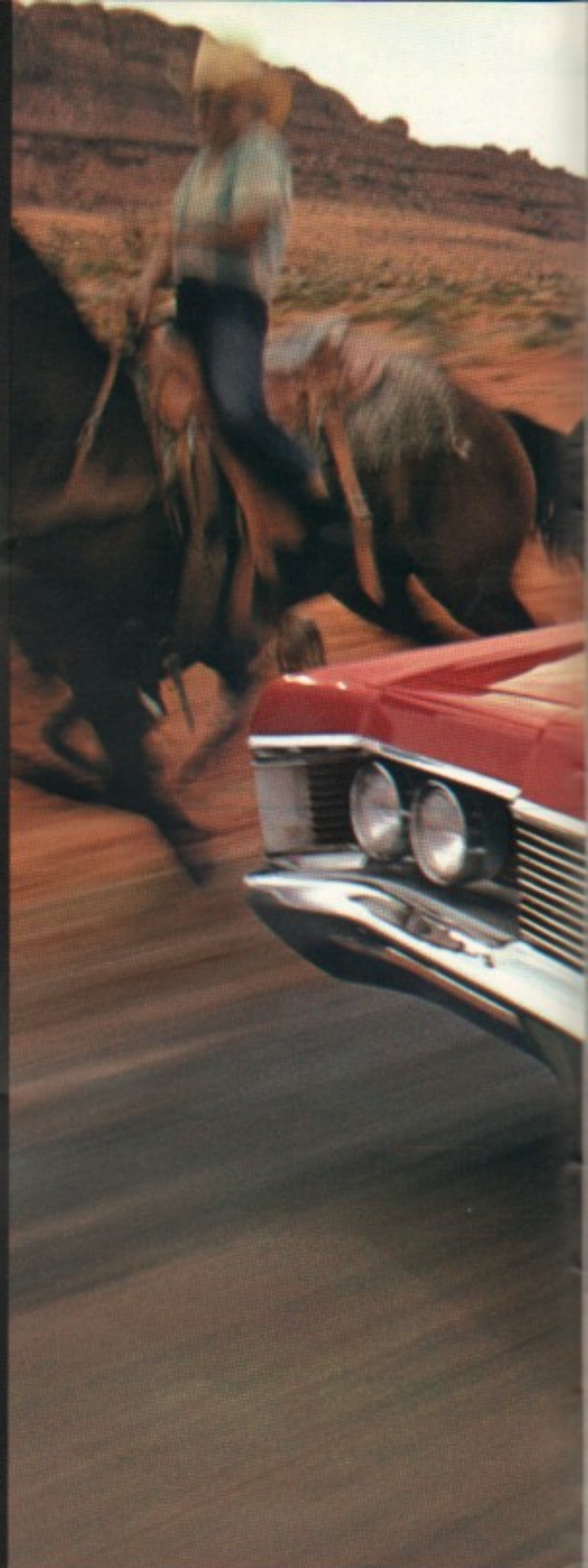
MONTEREY CONVERTIBLE SHOWN UPPER LEFT; PARK LANE SHOWN ABOVE AND UPPER RIGHT