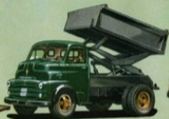
HIGH-LIFT DUMP TRUCKS