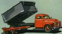
COAL DELIVERY TRUCKS