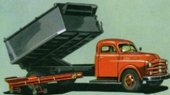
COAL DELIVERY TRUCKS