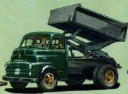
HIGH-LIFT DUMP TRUCKS