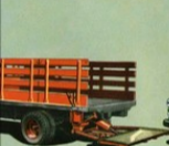
WITH POWER TAILGATE