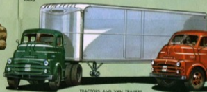
TRACTORS AND VAN TRAILERS