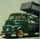
HIGH-LIFT DUMP TRUCKS