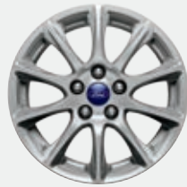
16" Painted Aluminum Standard: S