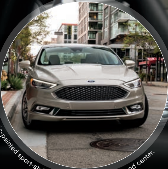
The Magnetic-painted sport-style grille puts Platinum front and center.

Every driver-assist technology Fusion offers is standard on Platinum. As is a Navigation System with SiriusXM® Traffic and Travel Link® to help guide you. Outside, Platinum distinction is marked by a Magnetic-painted sport-style grille, a power moonroof overhead, and 19" polished aluminum wheels 1 at the corners.