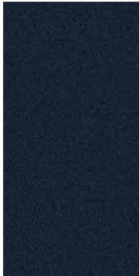
Black Pearl Slate Metallic 1, 2