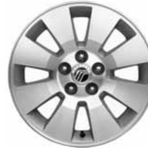
17" MACHINED-ALUMINUM WHEELS Standard on Mountaineer