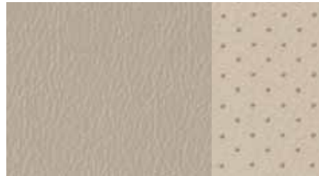
Camel Leather with Sand Perforated Leather Inserts 1