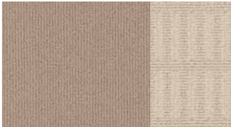
Camel Cloth with Sand Inserts