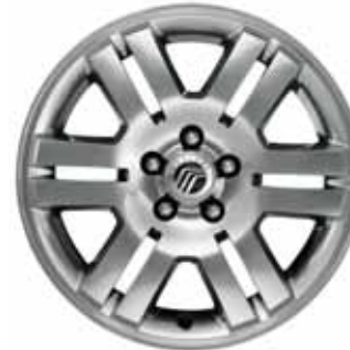
18" SATIN-ALUMINUM CHROME-CLAD WHEELS Standard on Premier