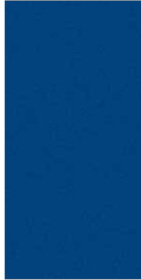
Blue Flame Metallic 1, 2