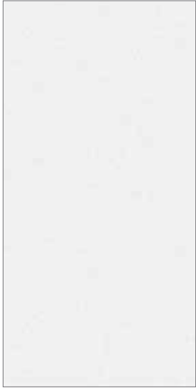
White Platinum Metallic Tri-Coat 1, 2