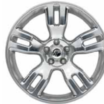
20" POLISHED-ALUMINUM WHEELS Available on Premier