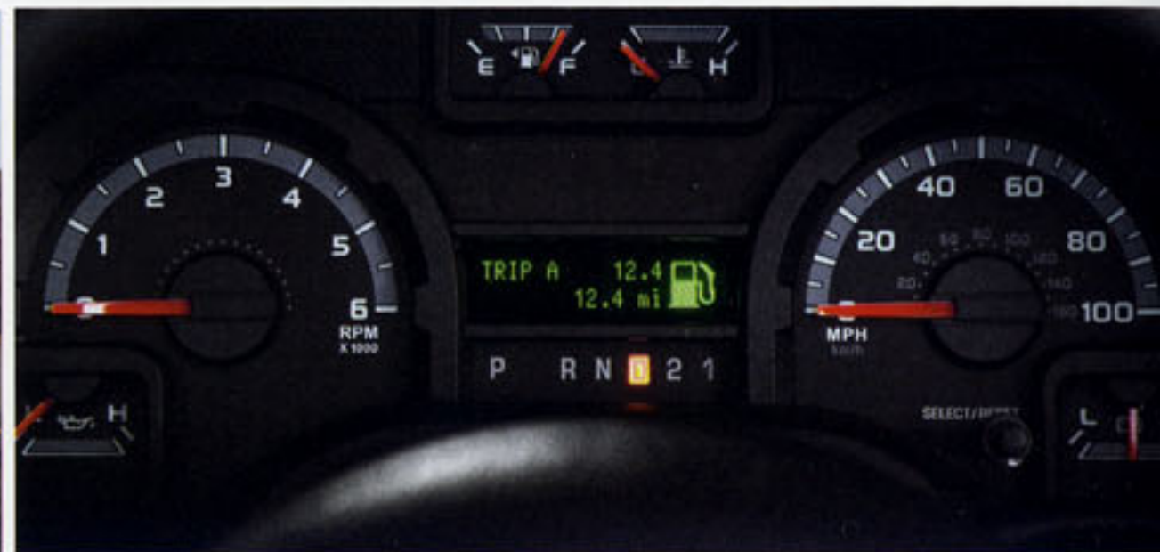
> All-new instrument panel is easy to use and provides plenty of storage too > E-Series Vans, Cutaways and Wagons offer you the most configurations > The new instrument cluster is clear, concise and includes a new optional message center