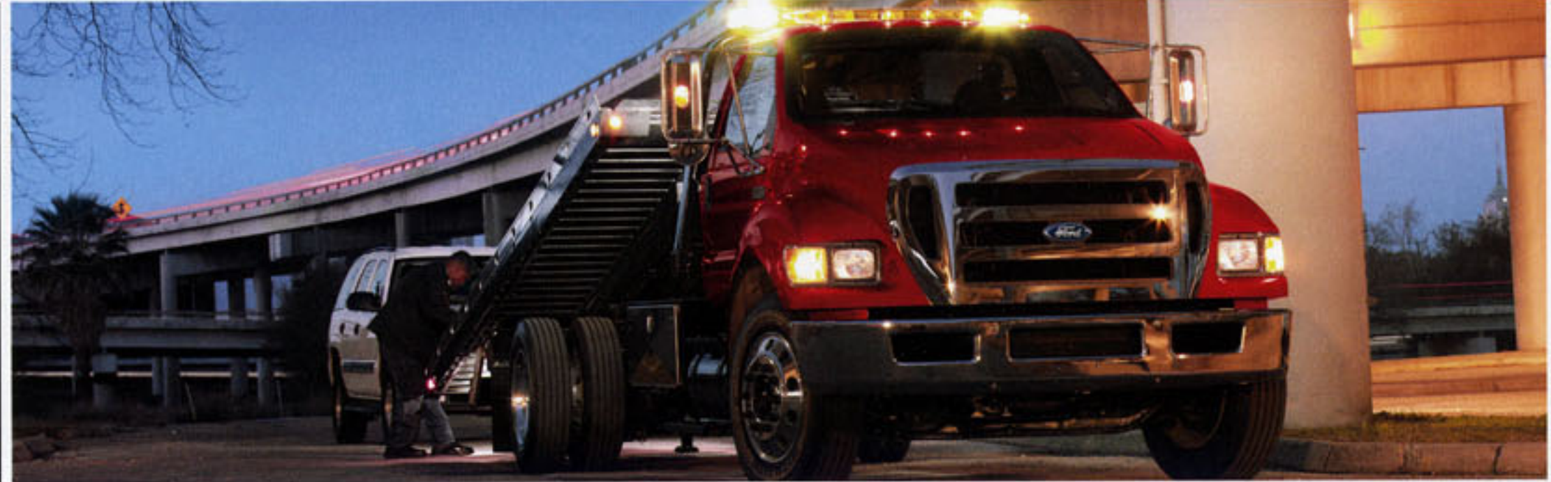
> Meritor® Quadraulic™ calipers deliver solid stopping power and ease of maintenance > A tilt-flatbed wrecker is just one of literally hundreds of upfits available for F-650 and F-750 Chassis Cabs