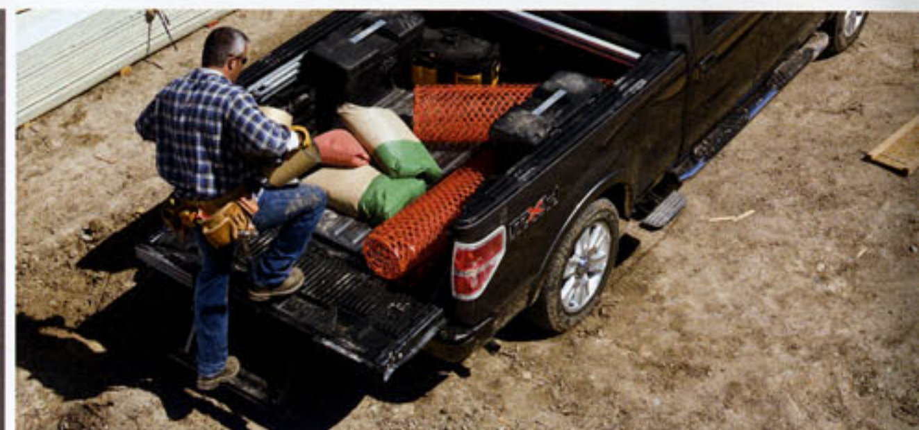
> New flat loadfloor (shown in SuperCrew) eliminates the center "hump" to make loading cargo easier > Available factory-integrated Trailer Brake Controller > New available Tailgate Step makes cargo box entry and exit a breeze