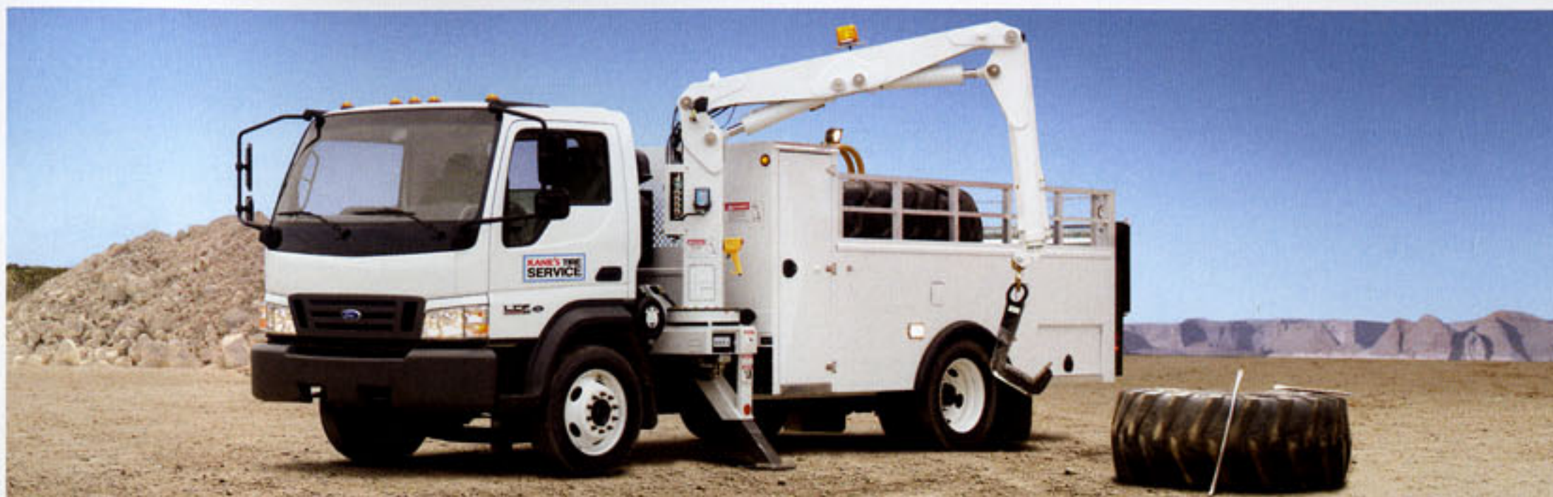
> A spacious cabin gives you a bird's-eye view of traffic > Ford LCF is one versatile machine — this off-highway tire service body is a particularly ingenious upfit