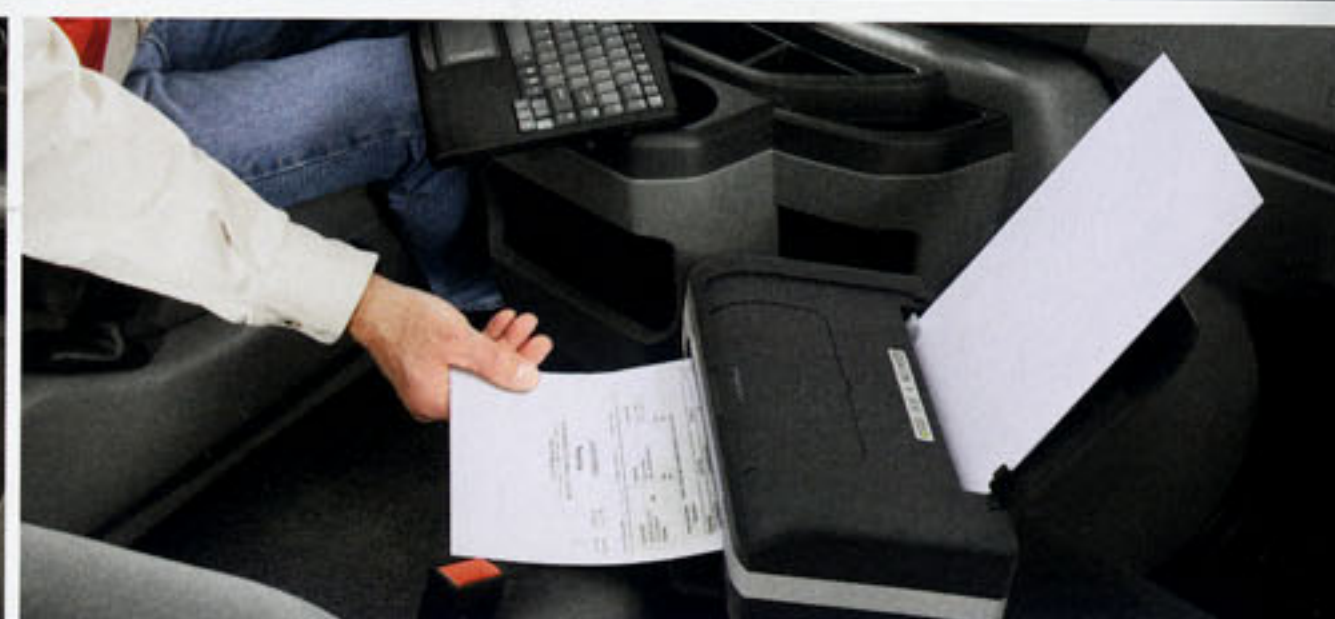
> In-dash computing offers word processing, spreadsheets, hands-free telephone capability and voice-activated nav > The included wireless keyboard lets you work right from the cab > Print documents with the available wireless printer