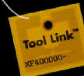
Tool Link RFID Tag