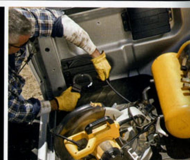
> The Crew Chief™ fleet management system lets you track your fleet 24/7 from any Internet-connected computer > Tool Link™ helps you keep track of your tools and combat tool loss > Cable Lock can help stop "grab and dash" thefts