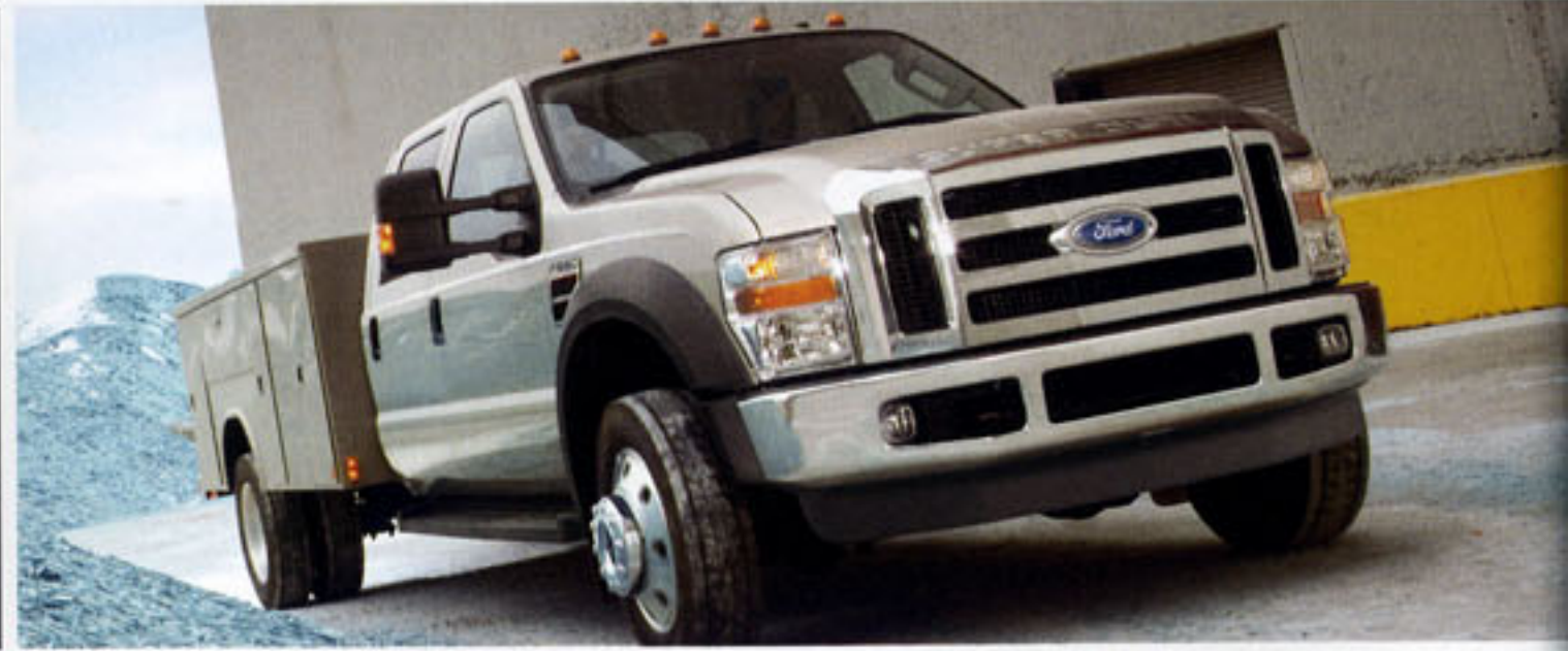
> Wide-open Crew Cab is available with front captain's chairs and center floor console > A choice of heavy-duty alternator systems pump out the amps > Chassis Cabs are prime for aftermarket utility bodies