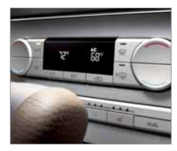
Dual-zone Electronic Automatic Temperature Control automatically maintains the selected temperature settings.

Complimentary maintenance makes driving your Lincoln even more of a pleasure. Simply bring it to an authorized Lincoln service center, and scheduled maintenance will be performed at no charge throughout your first year of ownership or 15,000 miles, whichever comes first. Additional peace of mind comes from a 4-year/50,000-mile bumper-to-bumper New Vehicle Limited Warranty that covers repair, replacement or adjustment of parts at no additional cost, as well as a 6-year/70,000-mile powertrain limited warranty which features no deductible and is fully transferable. And Roadside Assistance for 6 years or 70,000 miles provides the security of knowing that help may be only a phone call away should you run out of fuel, lock yourself out of the vehicle or need towing. Your Lincoln Mercury Dealer will provide complete details on all of these privileges.