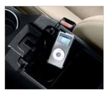
With the audio input jack located in the front center console, you can broadcast your digital media player through the vehicle's speakers.