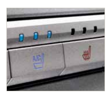
The tailored, leather-trimmed front seats of Lincoln MKZ are equipped with three levels of heating and cooling power.