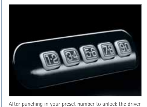
door, you can unlock all other doors and even open the trunk with the handy driver door keyless-entry keypad.

The 10-way power, leather-trimmed driver seat and power, heated sideview mirrors feature memory settings for two different drivers