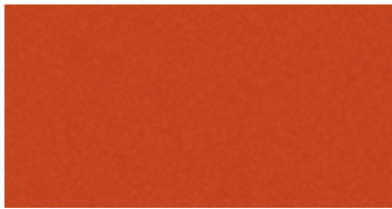
Blazing Copper Metallic