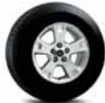
16" Aluminum Wheel Standard on XLT OWL tires standard on 4WD, optional on FWD