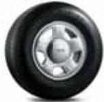
15" Styled-Steel Wheel Standard on XLS Manual and XLS