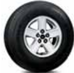
15" Aluminum Wheel Optional on XLS Manual and XLS