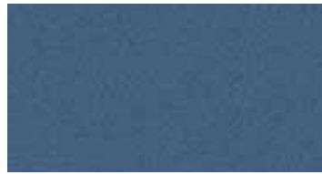
Norsea Blue Metallic