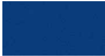
Sonic Blue Metallic