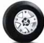
16" Bright Machined-Aluminum Wheel Standard on XLT Sport/ XLT No Boundaries Package/Limited OWL tires standard on XLT Sport and XLT No Boundaries Package