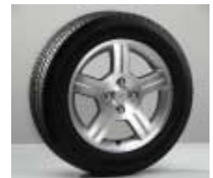
Optional 15" Bright Machined-Aluminum Wheel