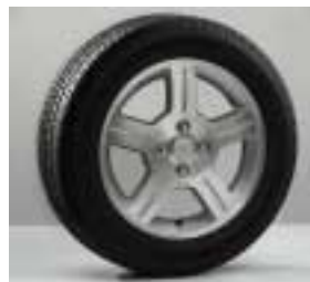
Standard 15" Painted Aluminum Wheel