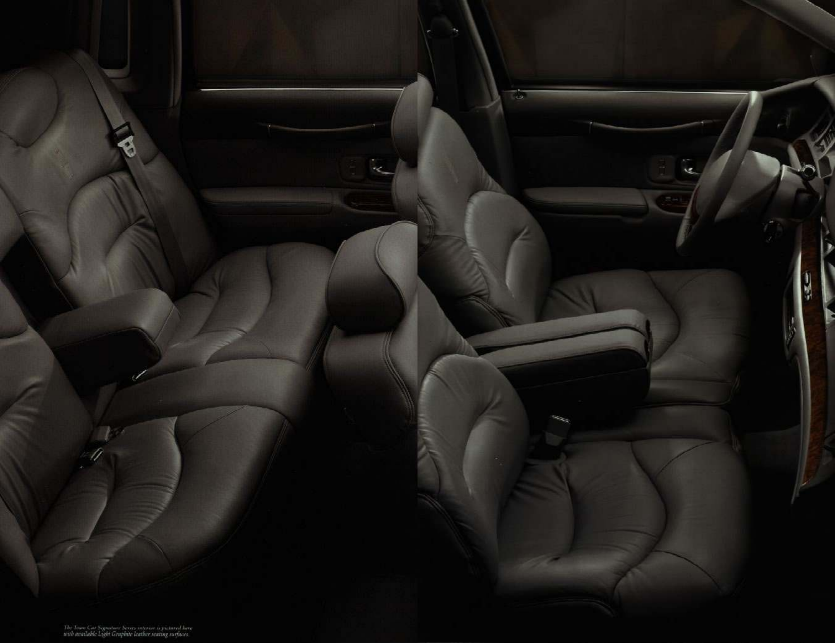
The Town Car Signature Series interior is pictured here with available Light Graphite leather seating surfaces.