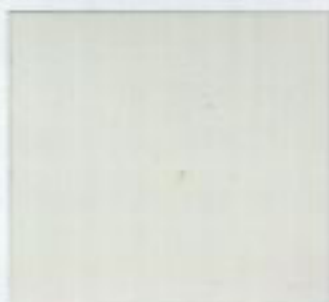
PERFORMANCE WHITE CLEARCOAT