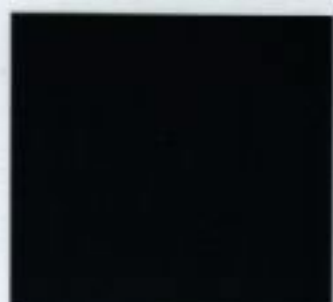
MEDIUM WILLOW GREEN CLEARCOAT METALLIC