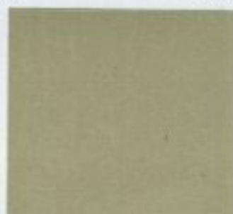
CARTIER MONOTONE: IVORY PEARLESCENT CLEARCOAT

CARTIER DUAL SHADE: CHARCOAL GREY CLEARCOAT METALLIC/MEDIUM GRAPHITE