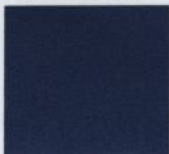
PORTOFINO CLEARCOAT METALLIC